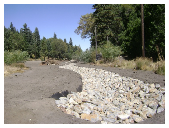
Photo 1: View looking downstream along constructed Hooks Creek channel. Photo taken October 4, 2016.

The "meadow restoration," as currently designed and constructed by the Natural Resources Conservation Service (NRCS). directs flows through a narrow rock-lined channel and series of sediment basins, essentially replacing what was once unconfined sheet flow across the 100+ acre Hencks Meadow (photo 1). This design may actually dewater the meadow not restore it. Staff has other concerns including the planned uses of the meadow with connected walking trails and new and existing hiking and biking trails. So where do we go from here? The next critical step for the developer is finalizing CEQA before the TUP expires in April 2017, otherwise the park will close if an extension is not granted by the County. For