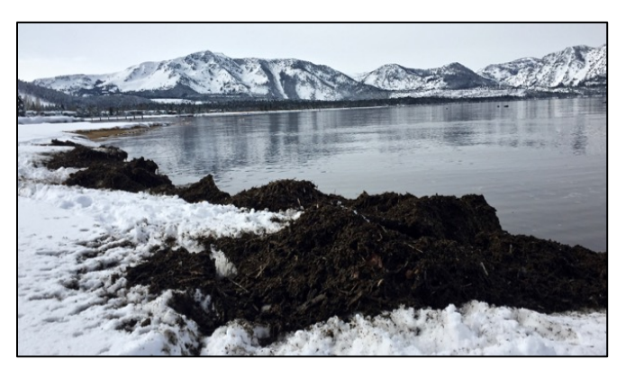
Figure 1 Rich soil covers the edge of the beach at Cove East.

"During this storm event our Tahoe Valley site, located off Tahoe Keys Boulevard, measured 1.5 million-cubic-feet of flow, nearly 90 percent of the flow that was observed throughout the whole 2016 water year," Sarah Bauwens with TRCD said in a statement.