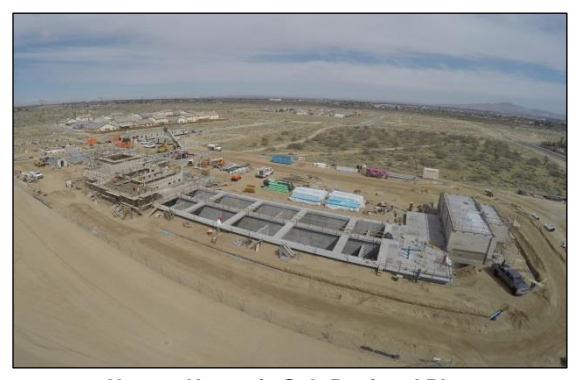
Above - Hesperia Sub-Regional Plant

The VVWRA currently operates one Regional Water Reclamation Plant that is producing and delivering disinfected tertiary recycled water for irrigation and for cooling purposes. The Apple Valley and Hesperia Sub-Regional Reclamation Plants are under construction and are scheduled for performance testing in the second quarter 2017 for the Hesperia plant and fourth quarter 2017 for the Apple Valley plant. These plants will soon be ready to deliver local tertiary treated recycled water within their jurisdictions.