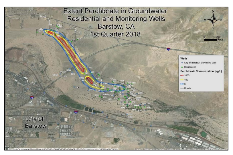
Figure 3 - Latest Plume Map showing the extent of perchlorate above the MCL

As of the January 2018 sampling event, eleven residential wells exceed the primary MCL for perchlorate. Of the eleven impacted residents, eight are supplied bottled water by the Water Board and two are supplied bottled water by the City of Barstow (these residences are also impacted by nitrate). One additional home is currently unoccupied and would be supplied water upon occupancy by the City of Barstow due to nitrate levels.