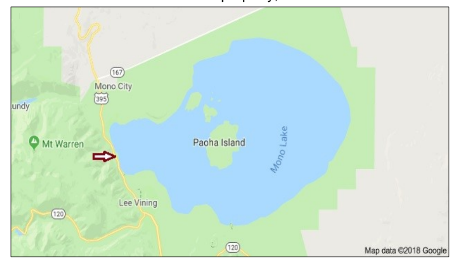
Figure 1 – The Tioga Lodge at Mono Lake property is located near the west shore of Mono Lake (red arrow).

similar work on adjacent, state-owned relict lakebed lands managed by the California Department of Parks and Recreation (California State Parks), further disturbing creek channels, soils, and wetland habitat on the relict lakebed. This work was completed without obtaining the required authorizations to do so from local (Mono County), state (Water Board, Department of Fish and Wildlife, and California State Parks),