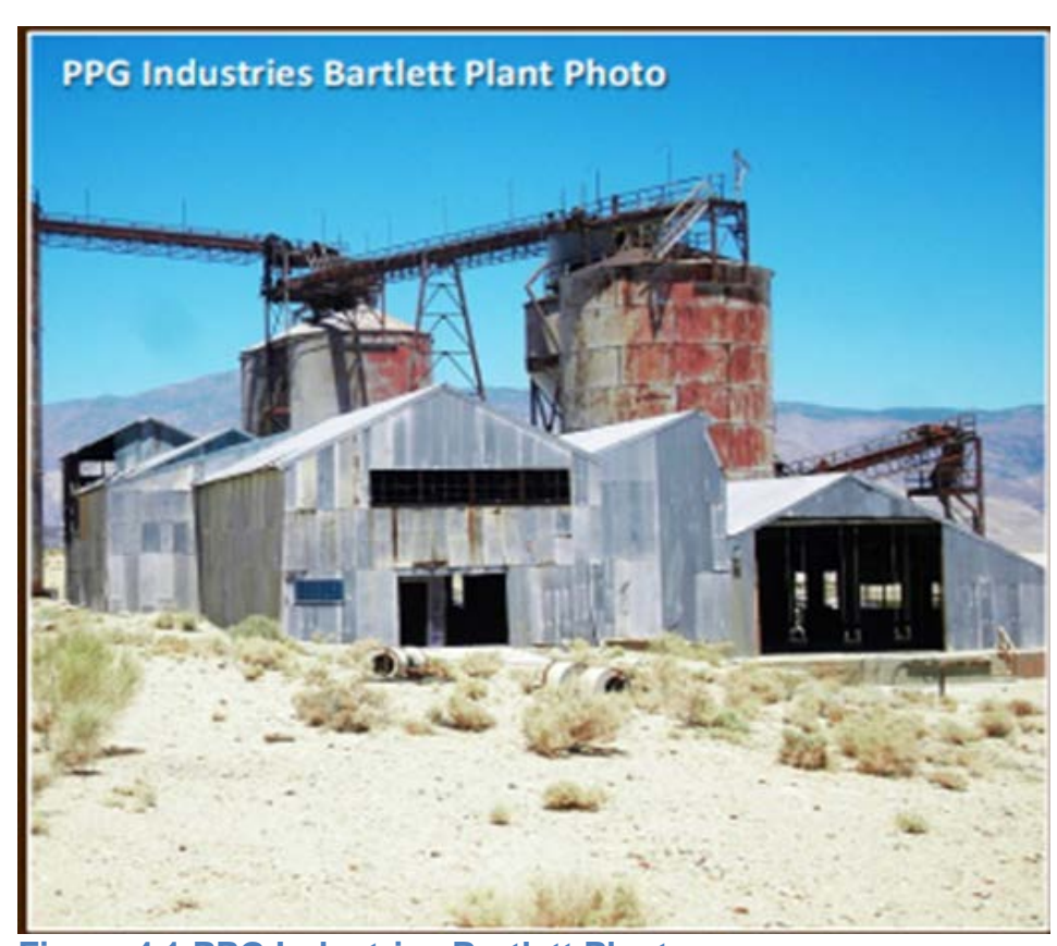
Figure 4.1 PPG Industries Bartlett Plant

Water Board staff anticipates being able to address site cleanup in a cooperative manner, based upon both responsible parties' willingness to proceed with cleanup on a voluntary basis. Additionally, a stakeholder group has been formed to: 1) help plan cleanup work tasks for multiple pollutants and media, 2) provide continuity between the site characterization phase and the remediation phase of the project, and 3) provide criteria for a successful remediation project. Members of the stakeholder's group include PPG, Tani Tatum, Inyo County, RDSBC, BEC Environmental, McGinley and Associates, the Water Board, and the Great Basin Unified Air Pollution District. This group represents the responsible parties, environmental consultants, and agencies that have jurisdiction over cleanup activities involving multiple pollutants and media. The stakeholder's group's first meeting is scheduled for November 2019.