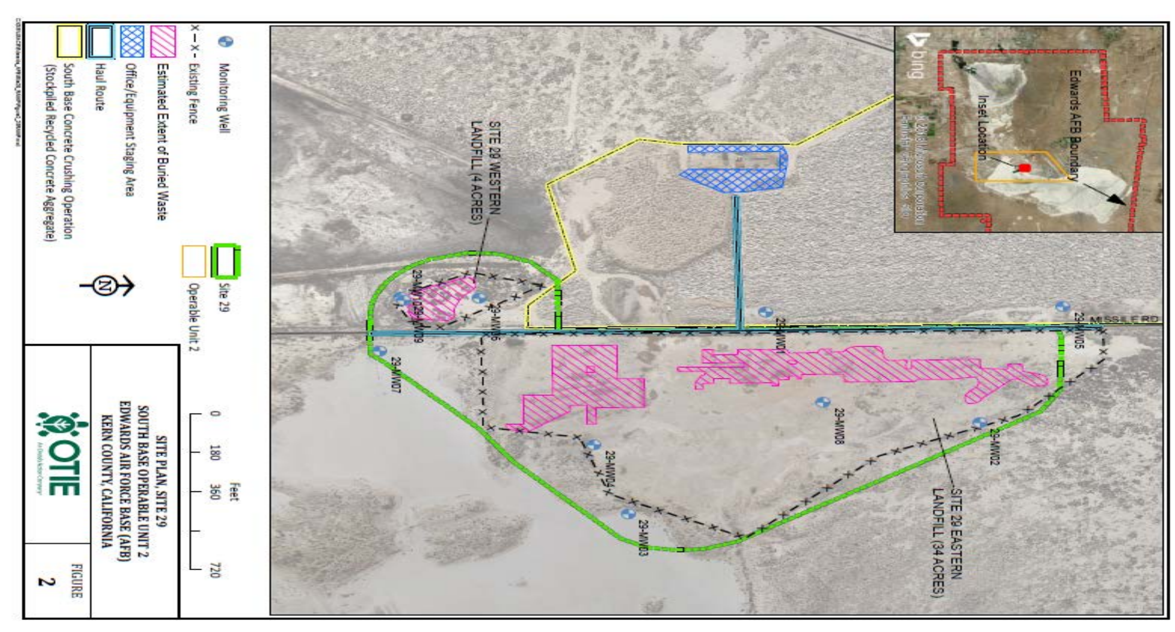
Figure 10.1 - Edwards AFB Site 29 1