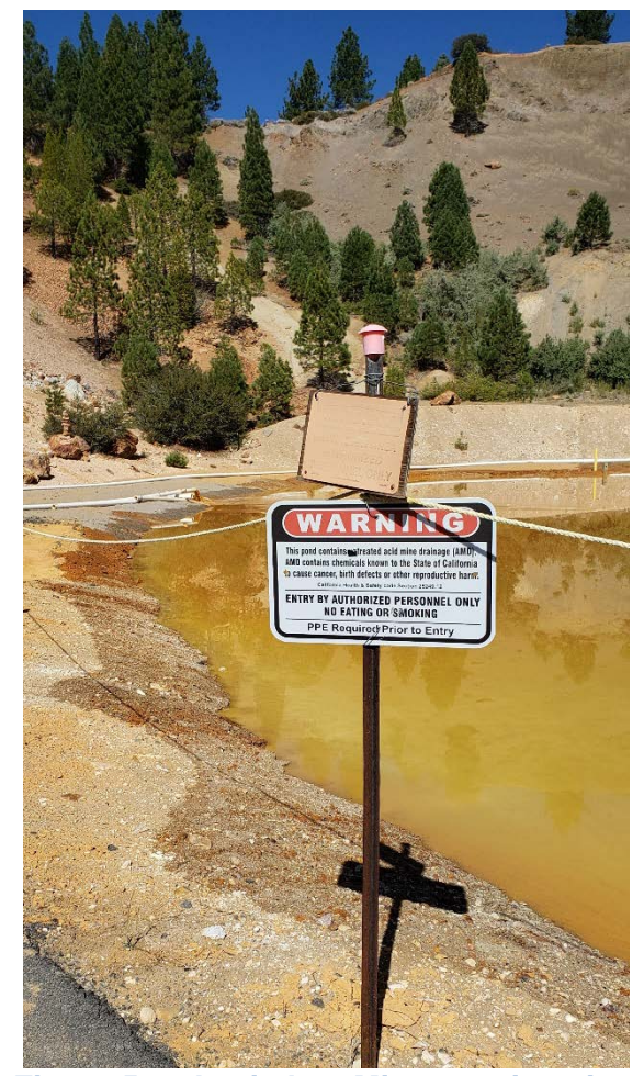
Figure 5.2 - Leviathan Mine warning sign

During the tour, Water Board staff explained how the Water Board and Atlantic Richfield are under United States Environmental Protection Agency (USEPA) Orders to capture and treat acid mine drainage from five sources at the mine site. Staff described the Water Board's year-round capture system (lined ponds constructed in 1984-1985) and seasonal treatment system that has been in operation since 1999, treating acid mine drainage from the mine site's two most polluted sources (Adit and Pit Underdrain). Staff also discussed how Atlantic Richfield seasonally (typically May – October) captures and treats acid mine drainage from two other nearby sources (Channel Underdrain and Delta Seep) using high density sludge technology. Both treatment systems rely upon lime addition and produce a sludge that is transported to disposal facility in Beatty, Nevada. Staff also briefly discussed Atlantic Richfield's Aspen Seep Bioreactor system that provides year-round capture and treatment of the Aspen Seep, the fifth primary acid mine drainage source. The bioreactor treatment system incorporates a biochemical technology.