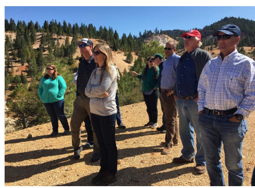
Figure 5.1 - Leviathan Mine tour attendees

The Leviathan Mine is a historical open pit sulfur mine that closed in the early 1960s. Exposing the underlying geology to the atmosphere and water created conditions generating acid mine drainage from multiple sources that flows into Leviathan Creek. The acid mine drainage has a low pH and high dissolved metals concentrations that adversely affect the water quality and beneficial uses of Leviathan Creek and downstream waters. Leviathan Creek is tributary to Bryant Creek, which flows into the East Carson River. In 1984, the State of California purchased the