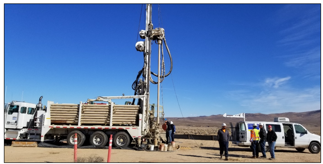
Figure 5.2 - Breaking down equipment after geophysical logging of the El Paso monitoring well borehole in the Indian Wells Valley Groundwater Basin. View looks east toward the El Paso Mountains.

The work is being completed for the IWVGA, the Groundwater Sustainability Agency (GSA) for the basin, through the Department of Water Resources (DWR) Technical Support Services (TSS) Program. The TSS Program offers support to GSAs by providing funding and services including monitoring well installation, geologic logging, borehole geophysical logging, borehole video logging, and groundwater level monitoring training. The TSS Program prioritizes requests from basins in critical overdraft.