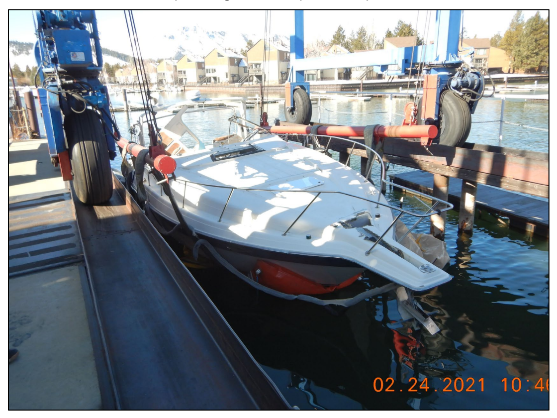
Photo No. 3.2 - Recovered boat being lifted out of the water at Tahoe Keys Marina

The responding agencies will be meeting to conduct an after-action review, and to share information regarding each agency's options and processes for responding to similar situations. The review will help the agencies improve response efforts in the future.