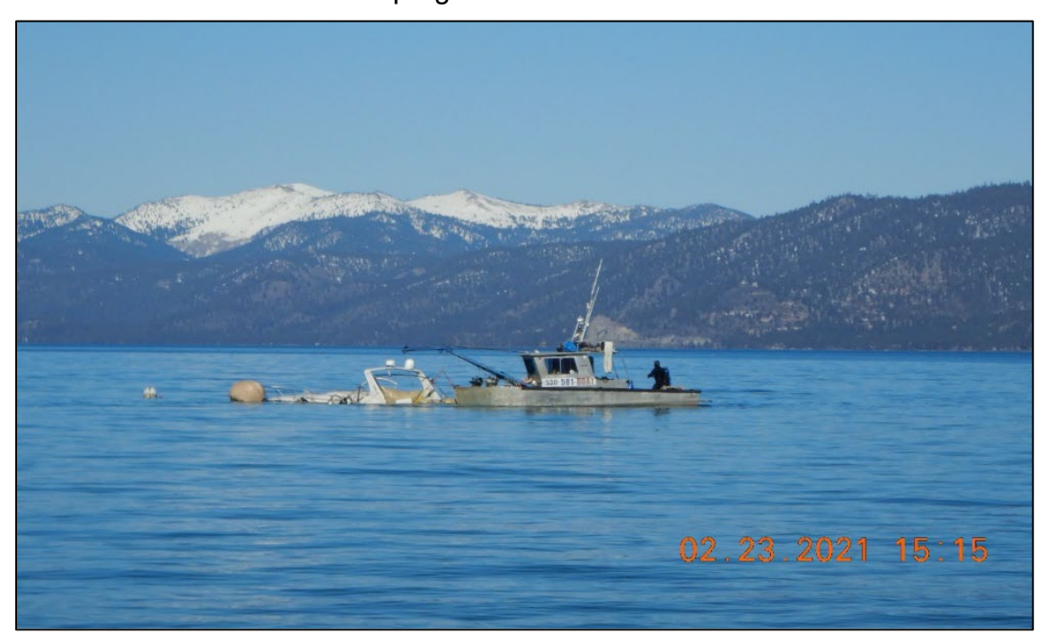
Photo No. 3.1 - High Sierra Marine preparing to tow the sunken boat from Jameson Beach to Tahoe Keys Marina

The Water Board, California Department of Fish and Wildlife, United States Environmental Protection Agency (US EPA), and El Dorado County Sheriff's Department all have programs that can be implemented to address abandoned boats, with implementation being more complex for some programs than others. In this case, the Water Board's and US EPA's programs were enacted.