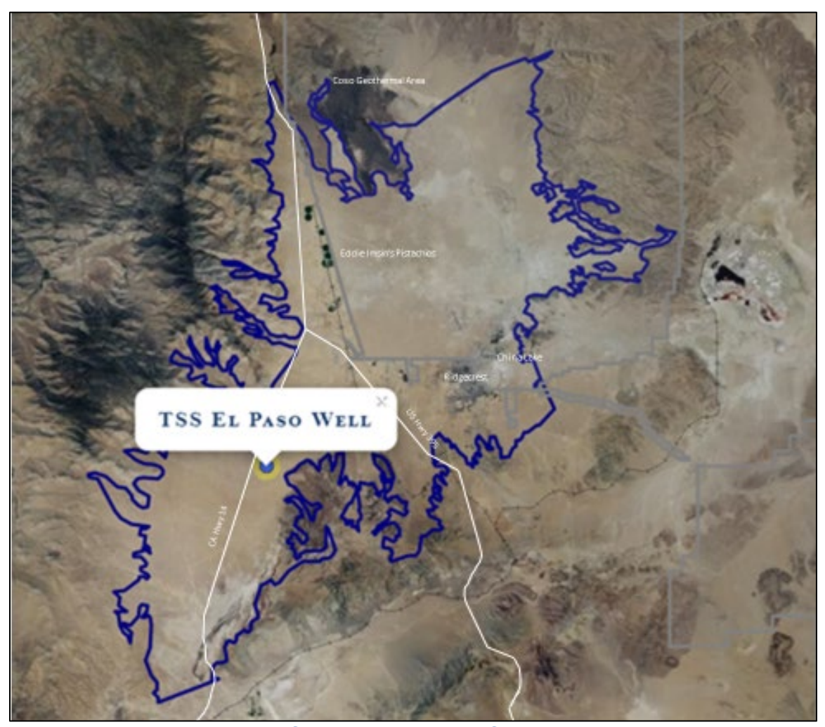
Figure 5.1 - Location of the Department of Water Resources (DWR) Technical Support Services (TSS) El Paso monitoring well drill site within the Indian Wells Valley groundwater basin (outlined in blue).

about 8 miles south of Inyokern and \frac{1}{2} mile east of California State Highway 14 (see Figure 5.1).