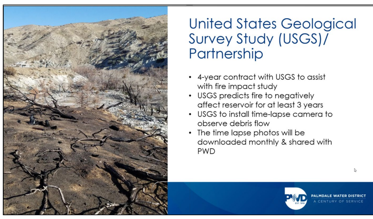
Figure 6.2 - Slide from Palmdale Water District presentation showing information on the upcoming USGS study.