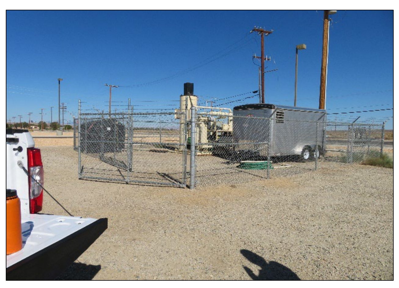
Photo 3.1: View of the air sparge (AS)/soil vapor extraction (SVE) system at Site 297. The SVE system (beige system in background) was upgraded with a new Mako Industries Inc. (Mako) thermal/catalytic oxidizer SVE system in June 2021. This replaced the repurposed Baker Furnace SVE system that was installed onsite in 2019.