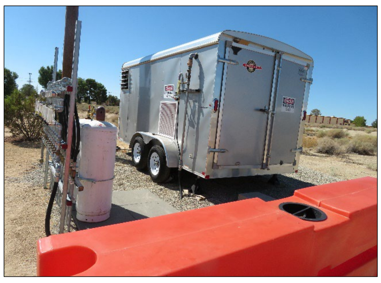
Photo 3.2: View of the upgraded BioSparging system at Site 298. Air compressor was upgraded/replaced (inside of trailer). Several flow regulators were also upgraded (seen on left side of photo) so that more air can be delivered to the subsurface.