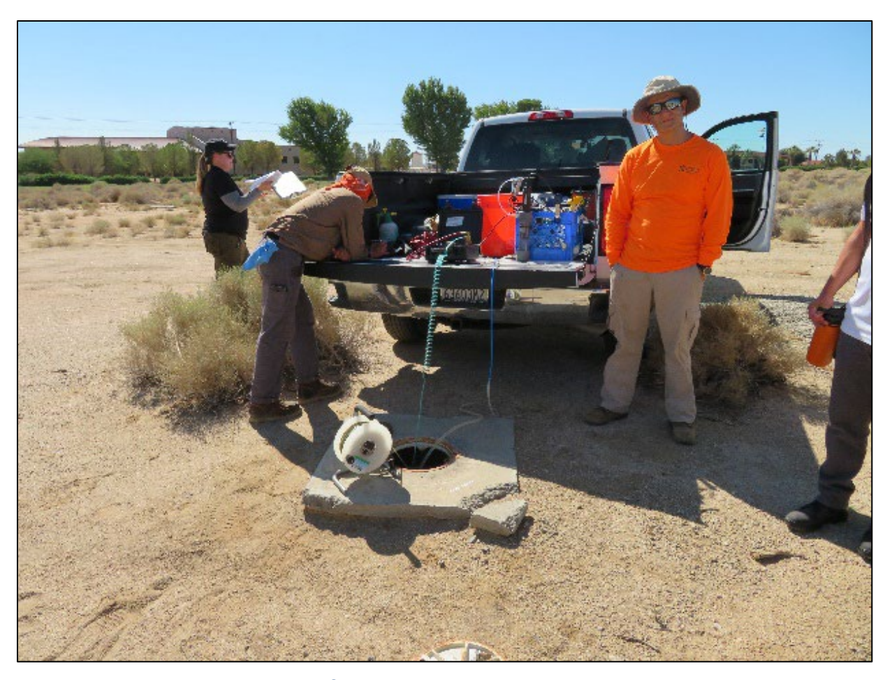
Photo 3.3: Air Force consultant field crews collecting groundwater samples using low-flow sampling methodology at Site 298.