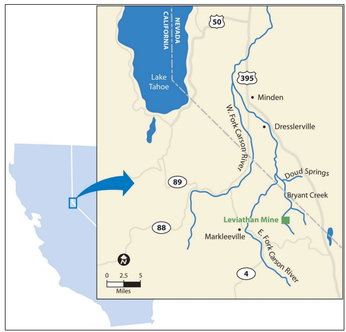
Figure 5.1— Leviathan Mine site location

the perpetual generation and discharge of acid mine drainage (AMD) from the mine property. The discharge of AMD adversely impacts downstream receiving waters.