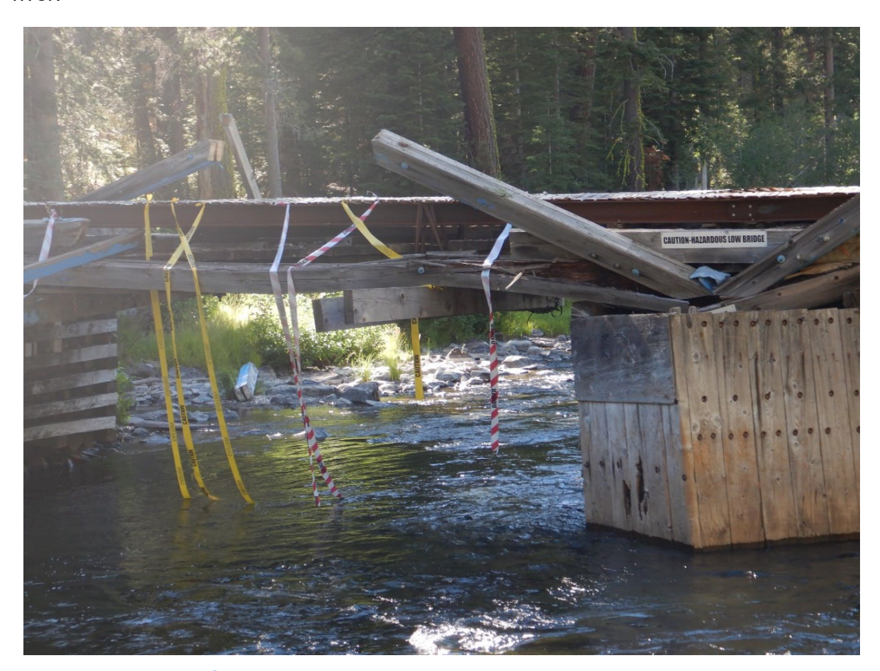
Figure 2.1—Photo of the collapsing bridge span with caution tape used to warn Truckee River recreators

Jim observed debris along the banks of the river and degrading of the bridge structure (see Figure 2.1). After leaving the site, Jim contacted the local fire department to confirm the alleged injury. Additionally, Jim contacted the Placer County building department and Supervising Deputy Counsel to discuss the safety issues. All parties were concerned about the possibility of additional debris creating safety hazards in the river.