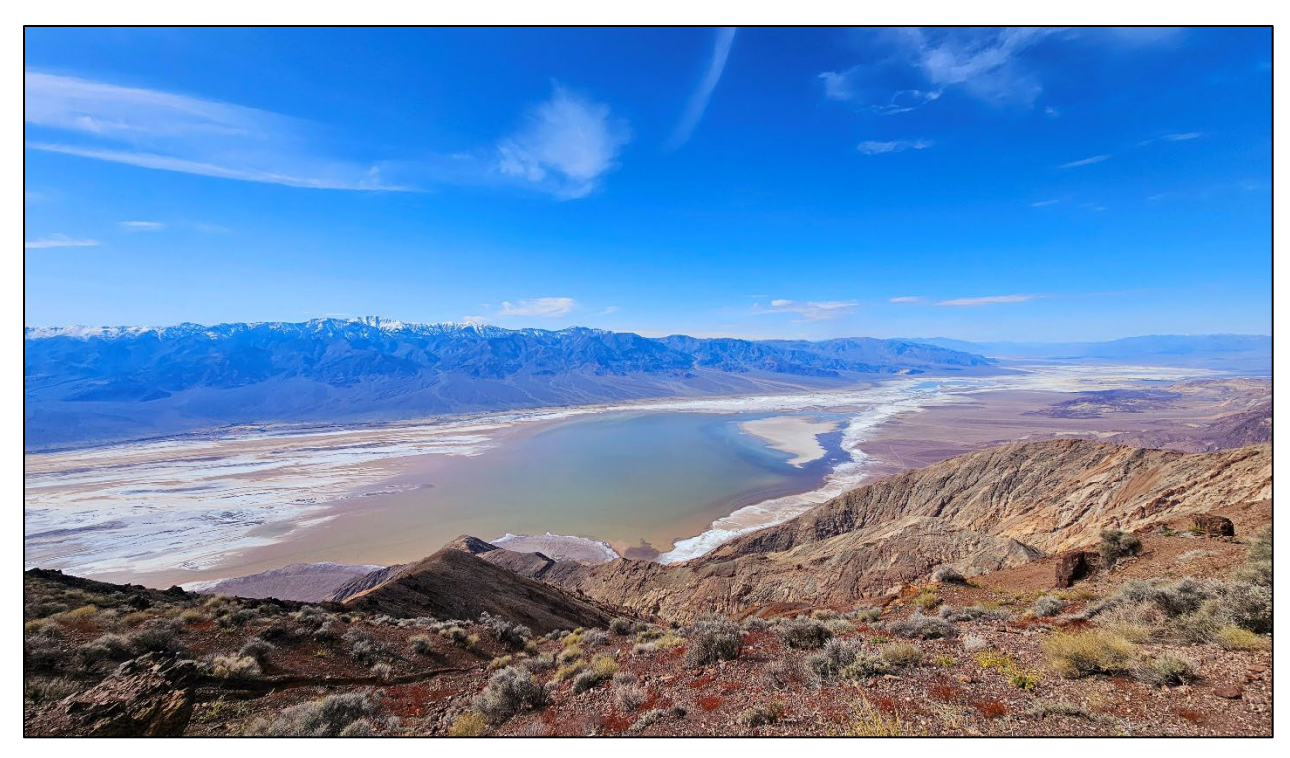
Figure 2.2: A view of Lake Manly from Dantes View.