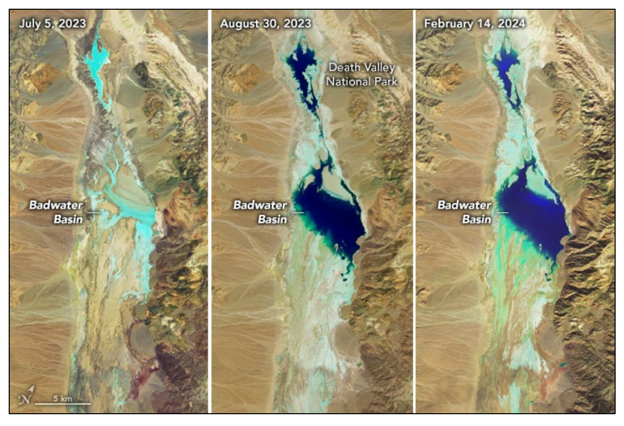
Figure 2.1: False Color Satellite Imagery Released By NASA Documenting Conditions In Badwater Basin From July 2023 Through Mid-February 2024 (NASA, 2024).

The series of images shown in Figure 2.1 are false color to emphasize the presence of water, which appears in shades of blue (NASA, 2024). The July 2023 image on the left shows the normally dry basin, while the middle image from late August 2023 highlights the effects of precipitation from Hurricane Hillary. The February 2024 image on the right shows the temporary lake that the National Park Service reports is about six miles long, 3 miles wide and one foot deep (National Park Service, 2024).