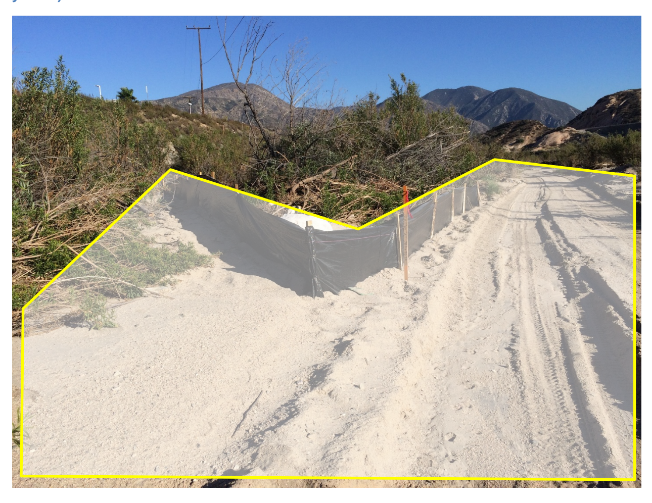
Picture 1: Unauthorized temporary impact in Cajon Creek (rough outline of area in yellow)