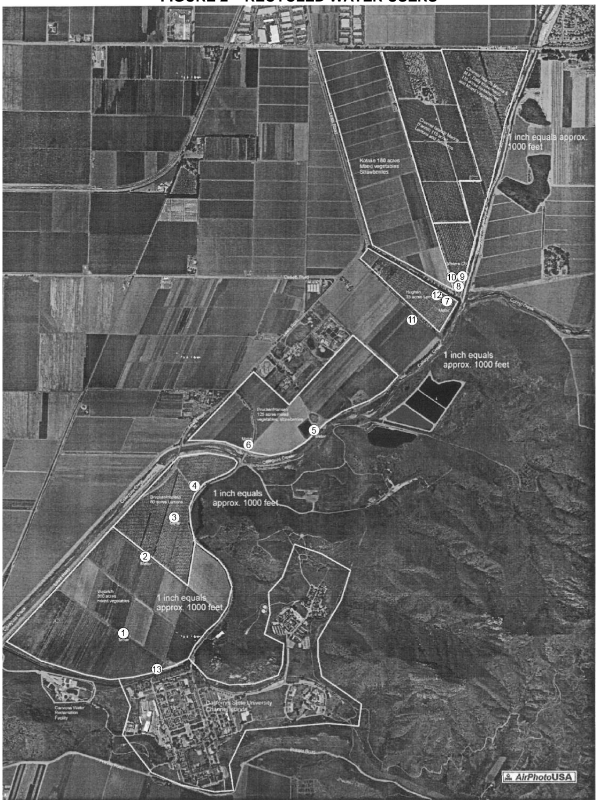
FIGURE 2 - RECYCLED WATER USERS