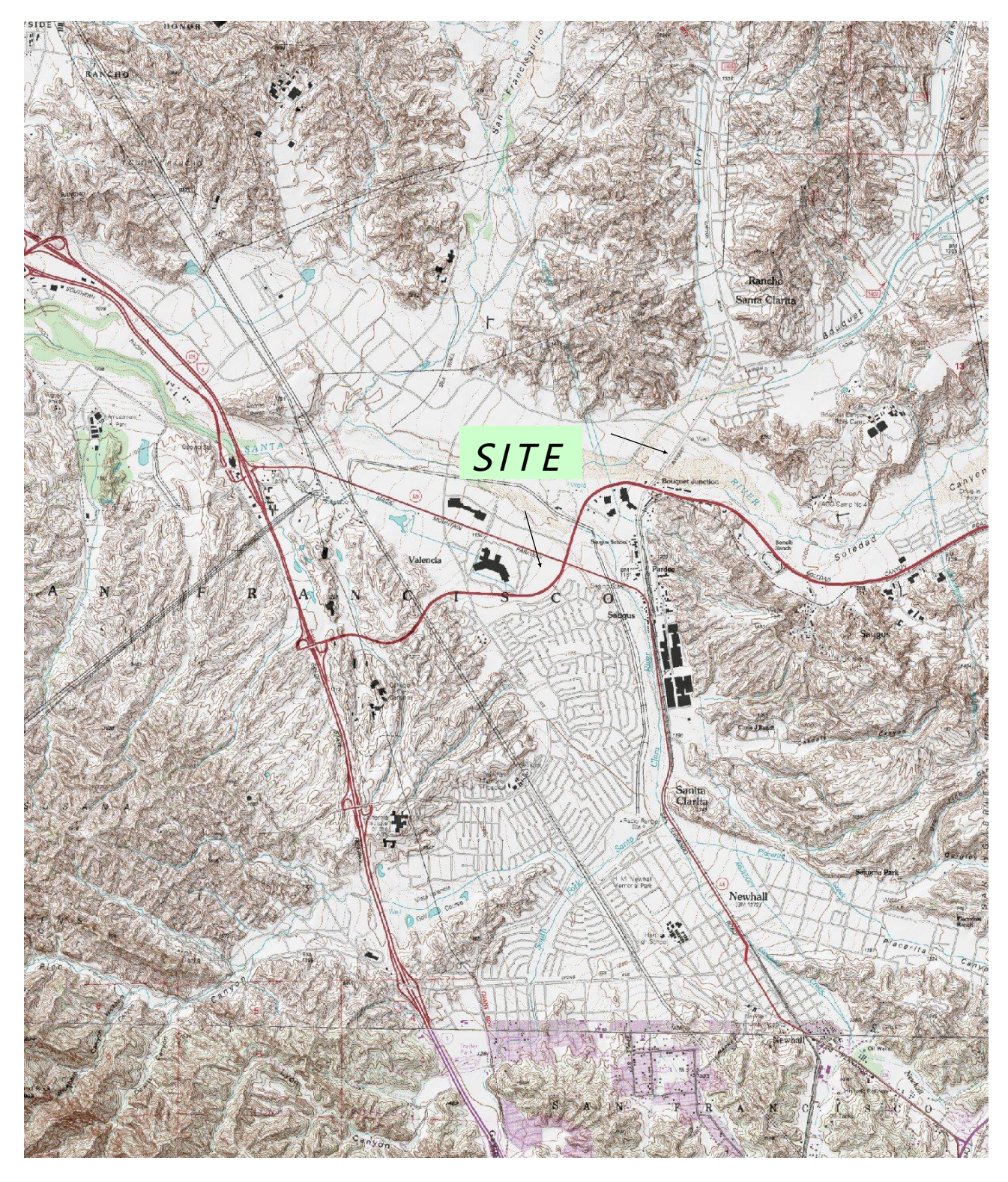
Figure 1. Site Locations