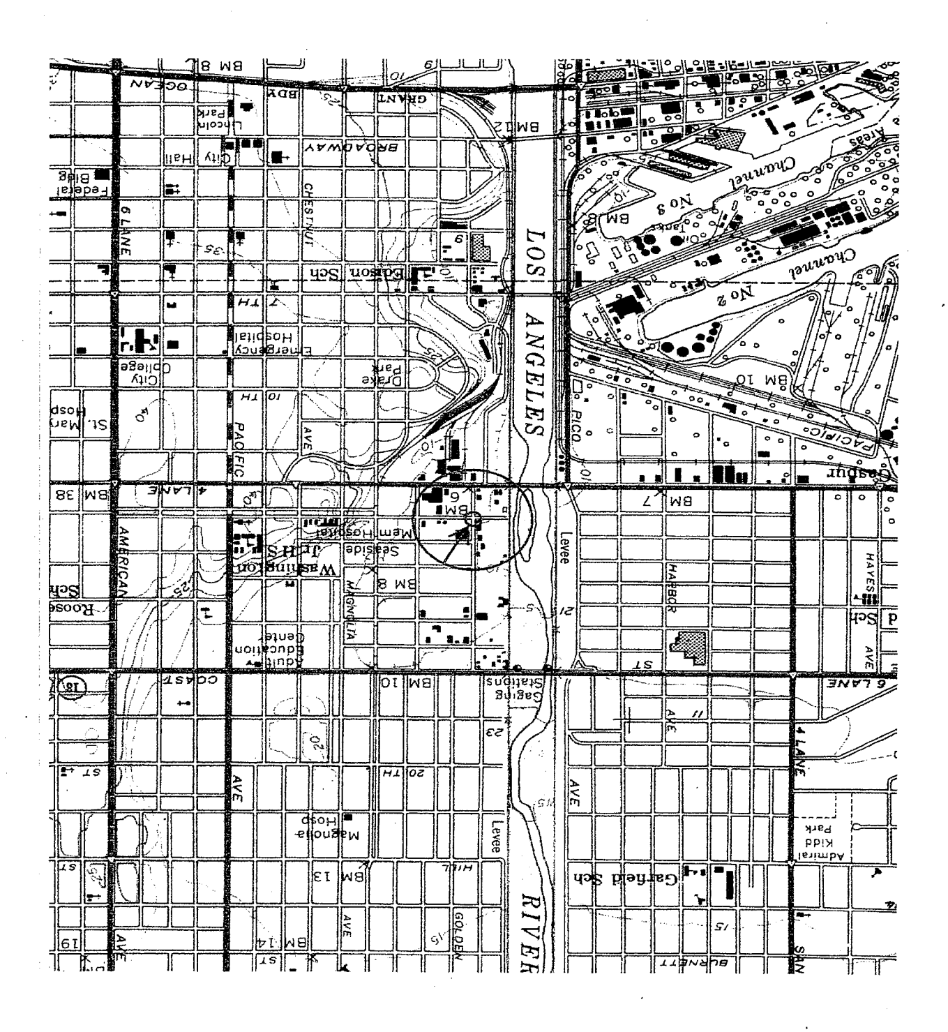
Figure 1 Site Map