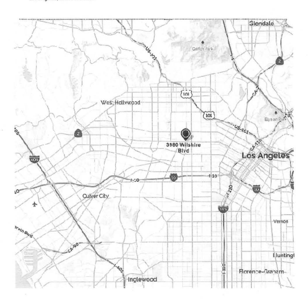
Figure 1. Site Map: 3980 Wilshire Boulevard, Los Angeles

(a) 1 3980 Wilshire Blvd 3980 Wilshire Blvd Los Angeles, CA 90010-3333