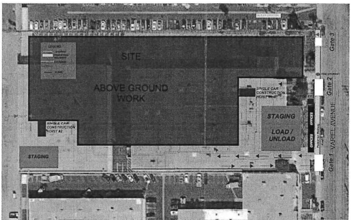
CITE LOCIOTIOS DEAN AUDED OTDUOTUDE