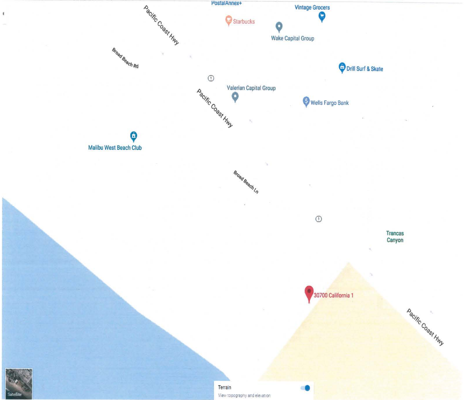
Figure 2. Terrain Map of the Area