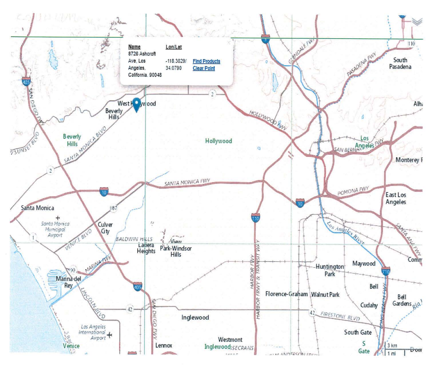
Figure 1. Area Map