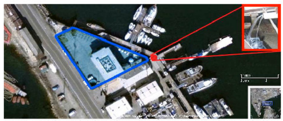
Figure 2. Aerial photograph of the Southern California Marine Institute facility outlined in blue. The red circle designates the location of the discharge pipe with a picture in the upper right.