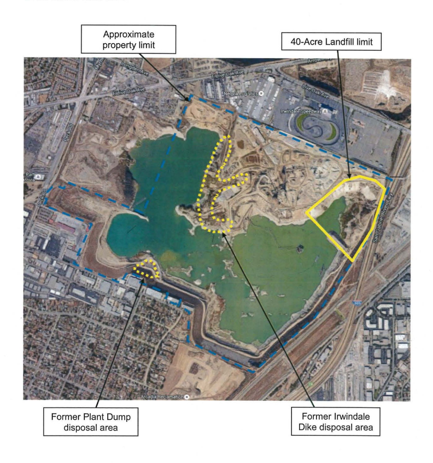
Figure 2. Site Map