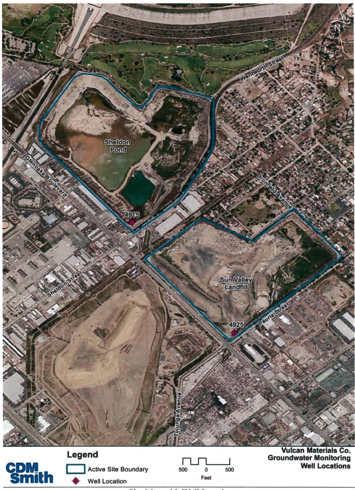
Site Map with Well Locations Figure 2