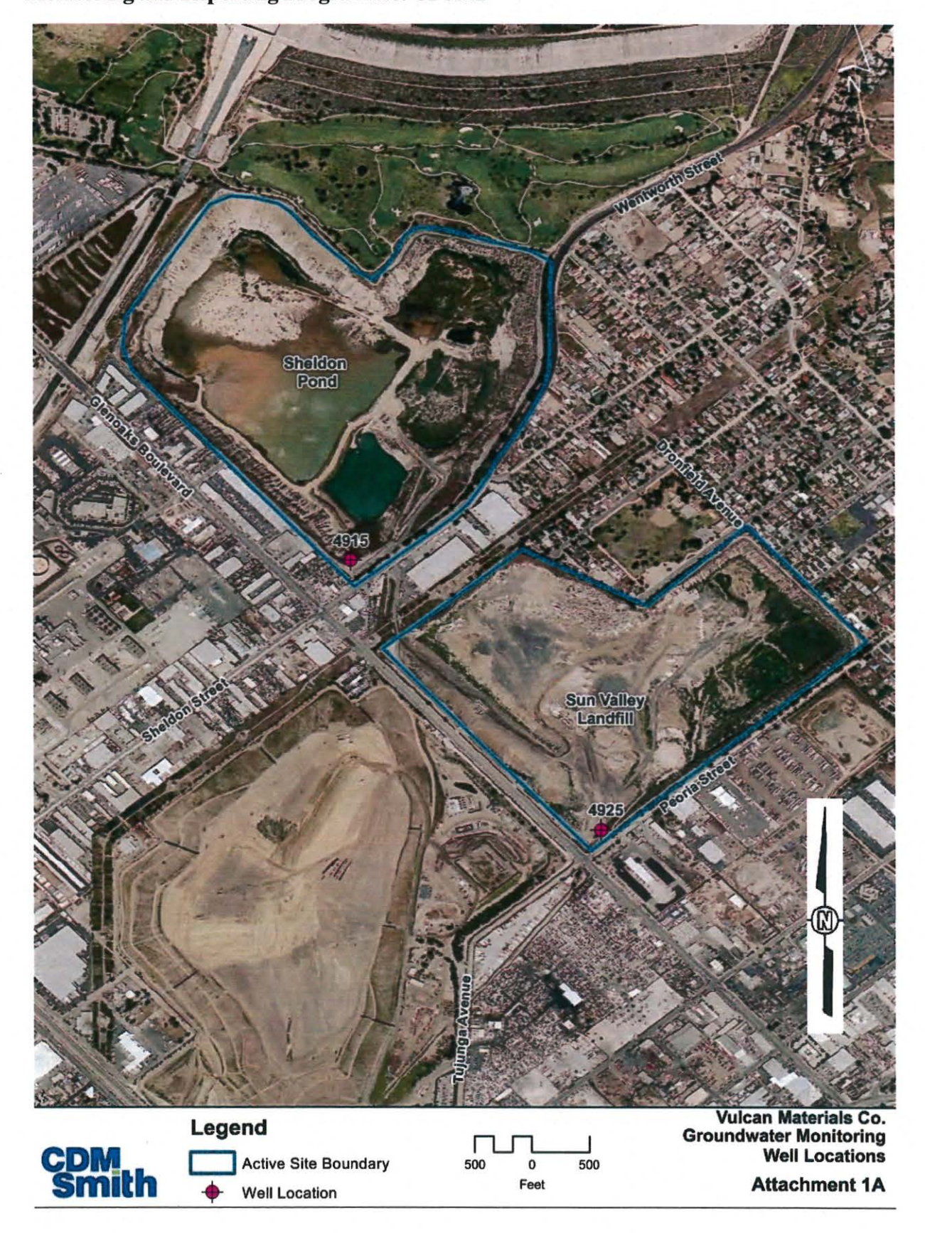
Figure T - 1. Groundwater Monitoring Well Locations