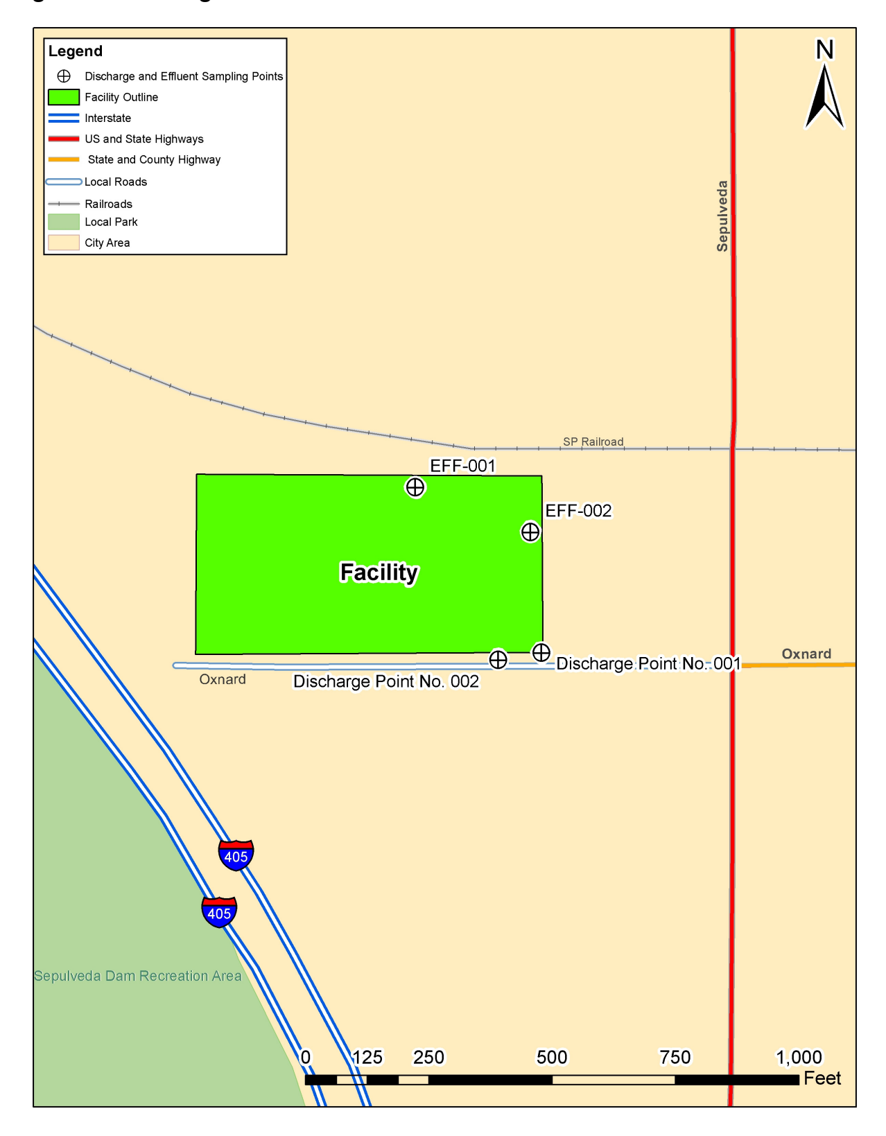
Figure 2. Discharge Points