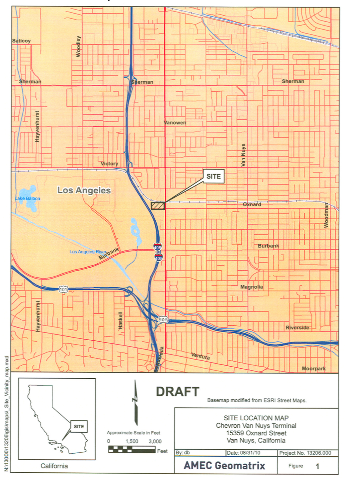
Figure 1. Site Location Map