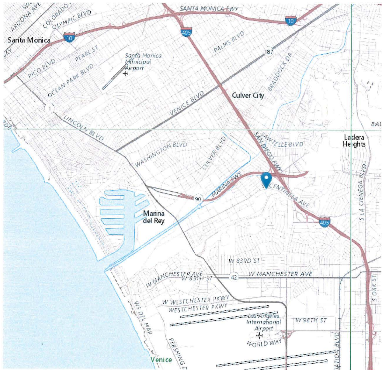
Figure 1a. Site Map