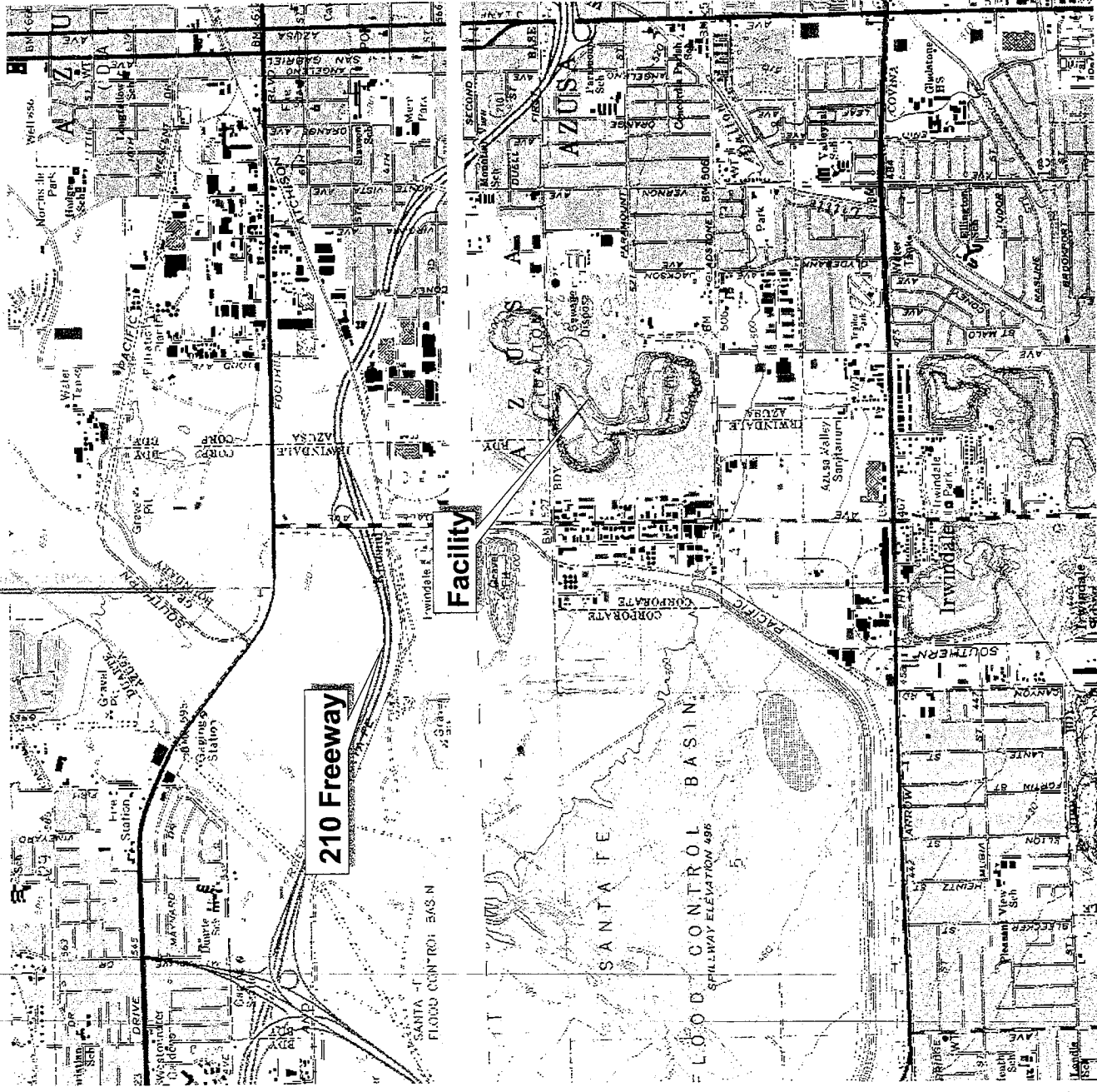
Figure 1: Southdown, Inc. (Azusa Facility) Location Map