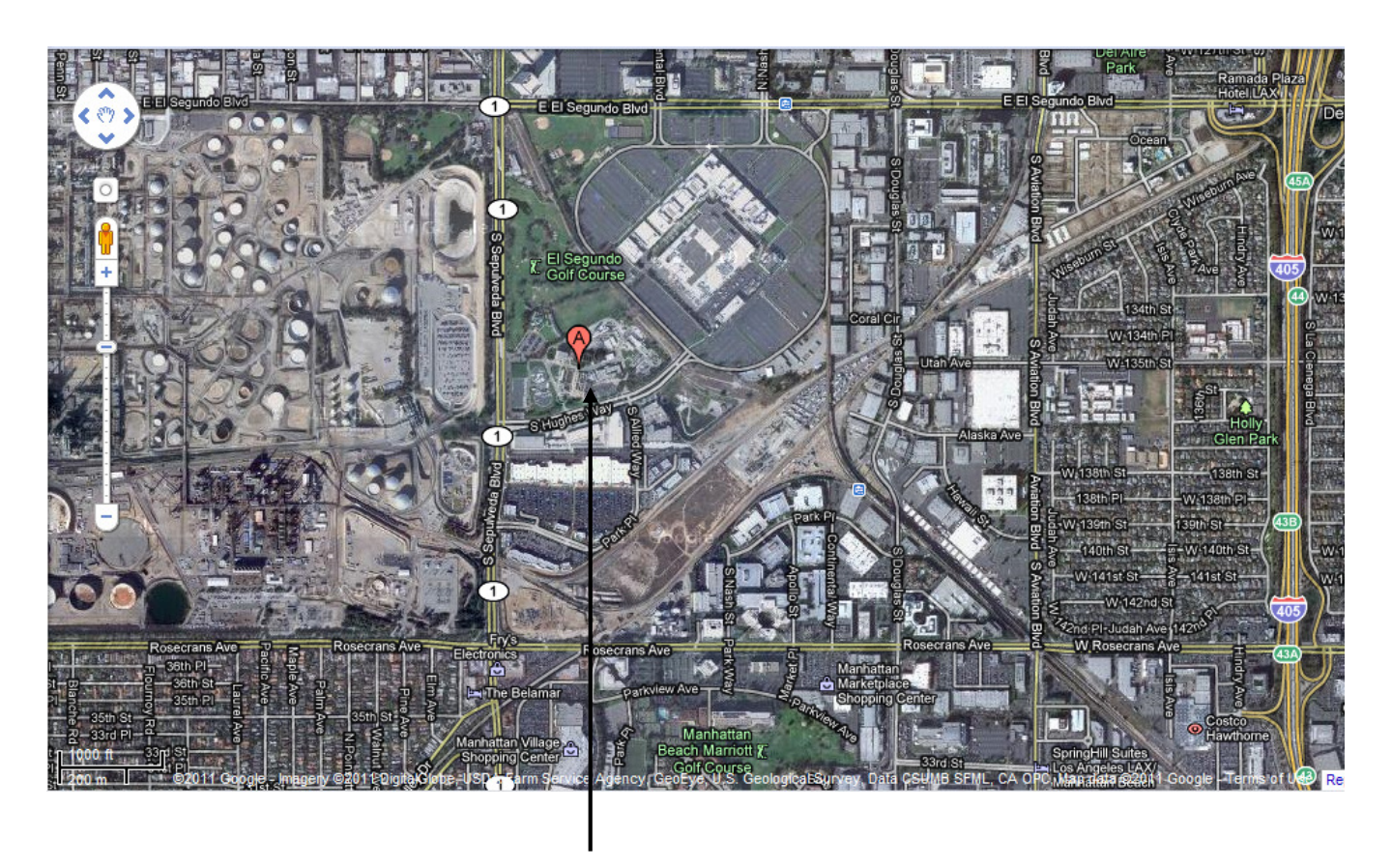
Edward C. Little Water Recycling Plant