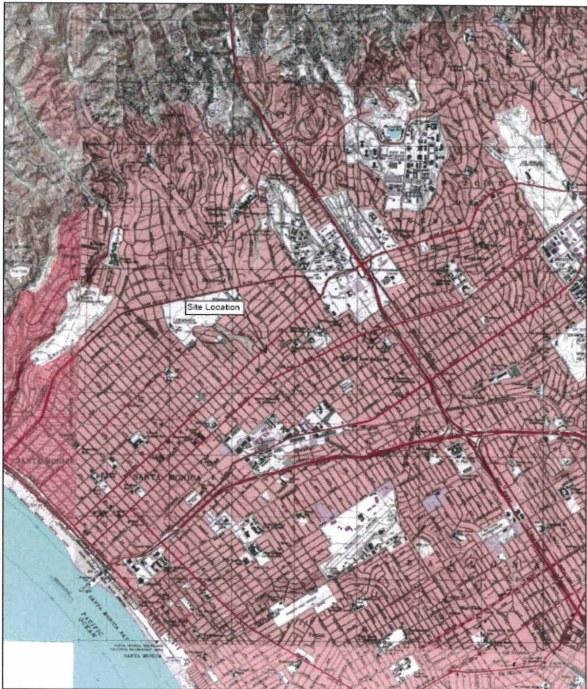
Figure 1. Site location map