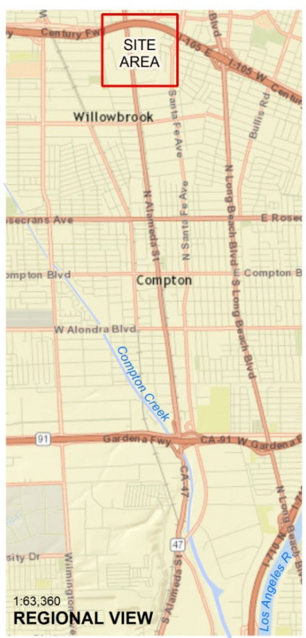
POLYNT COMPOSITES USA INC.