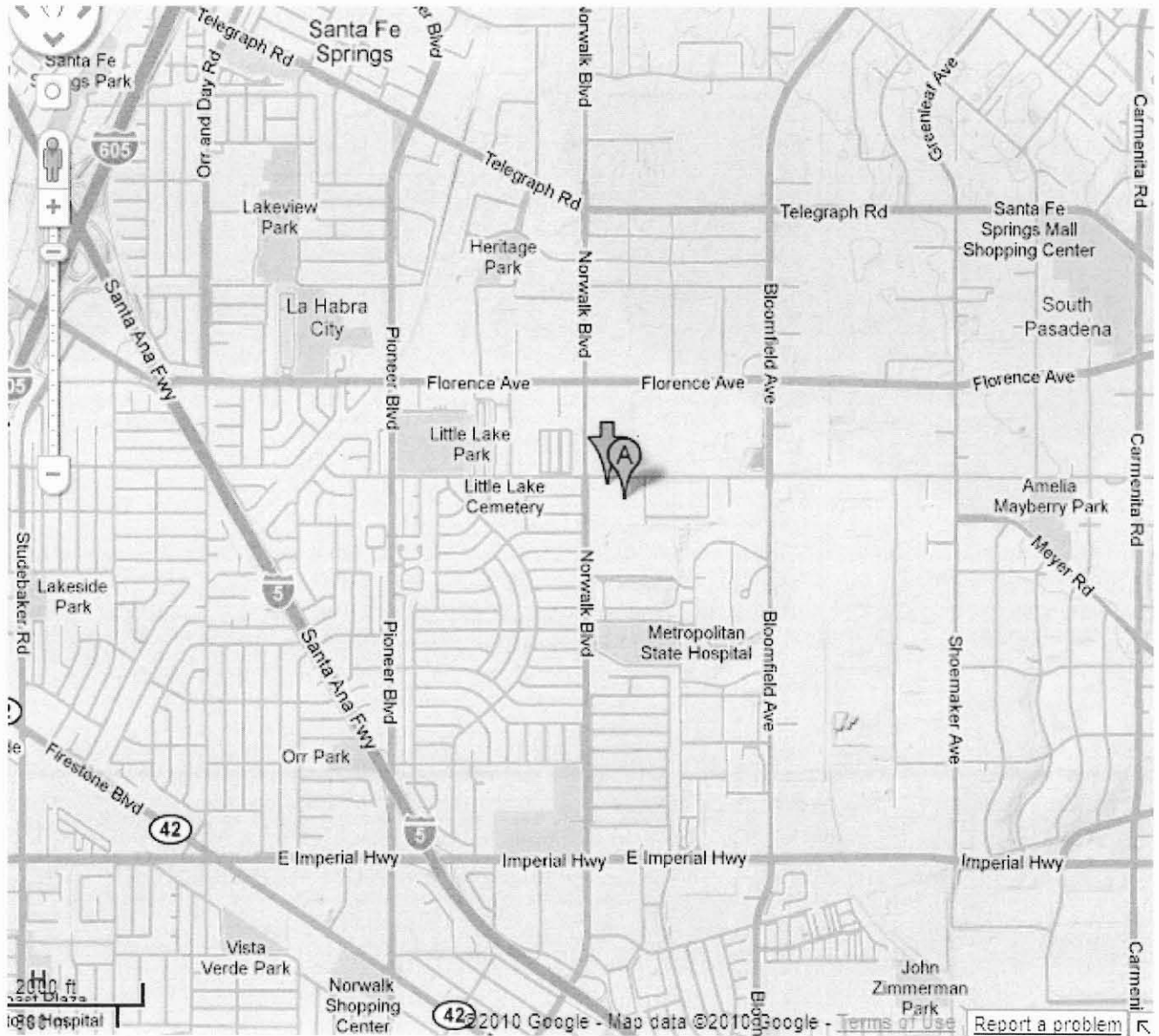
Figure 1—Site Map