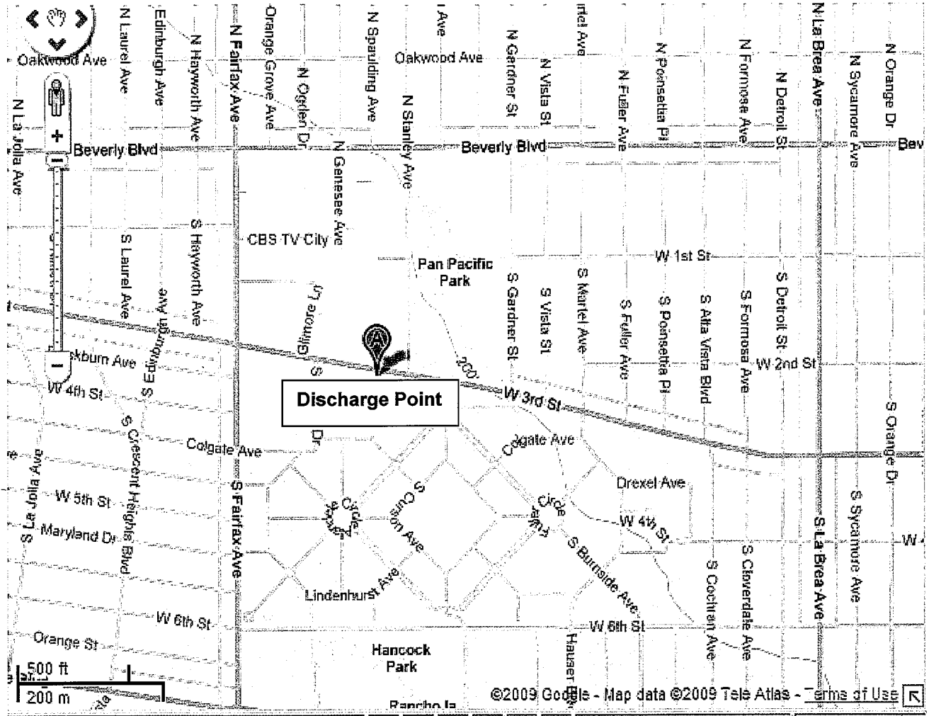
Site location Figure 1