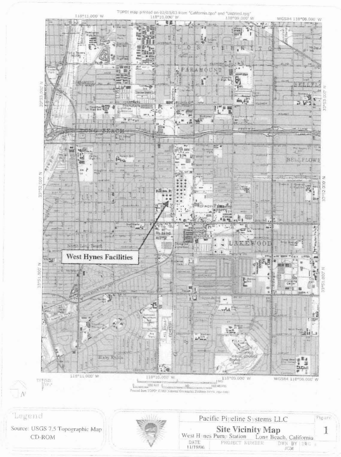
Figure 1. Site Location Map