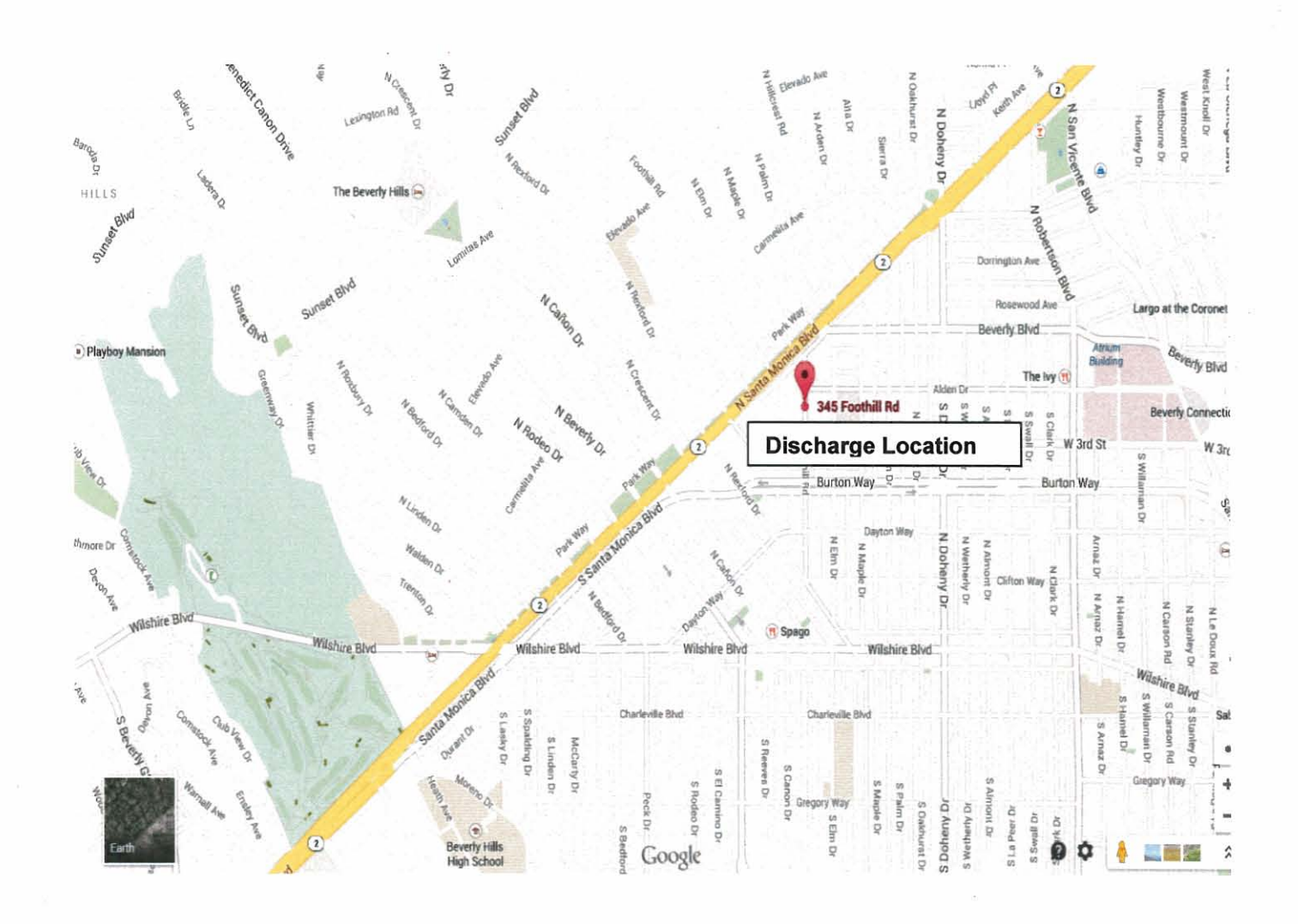
Site Location Figure 1