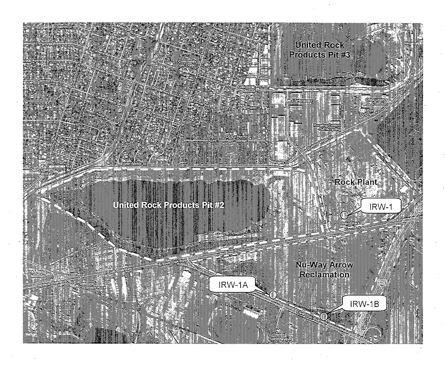
Figure T - 1. Groundwater Monitoring Well Locations