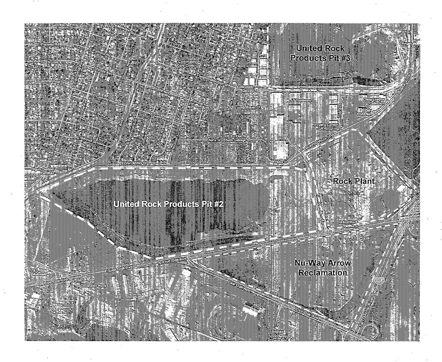
Figure 2. Vicinity Map