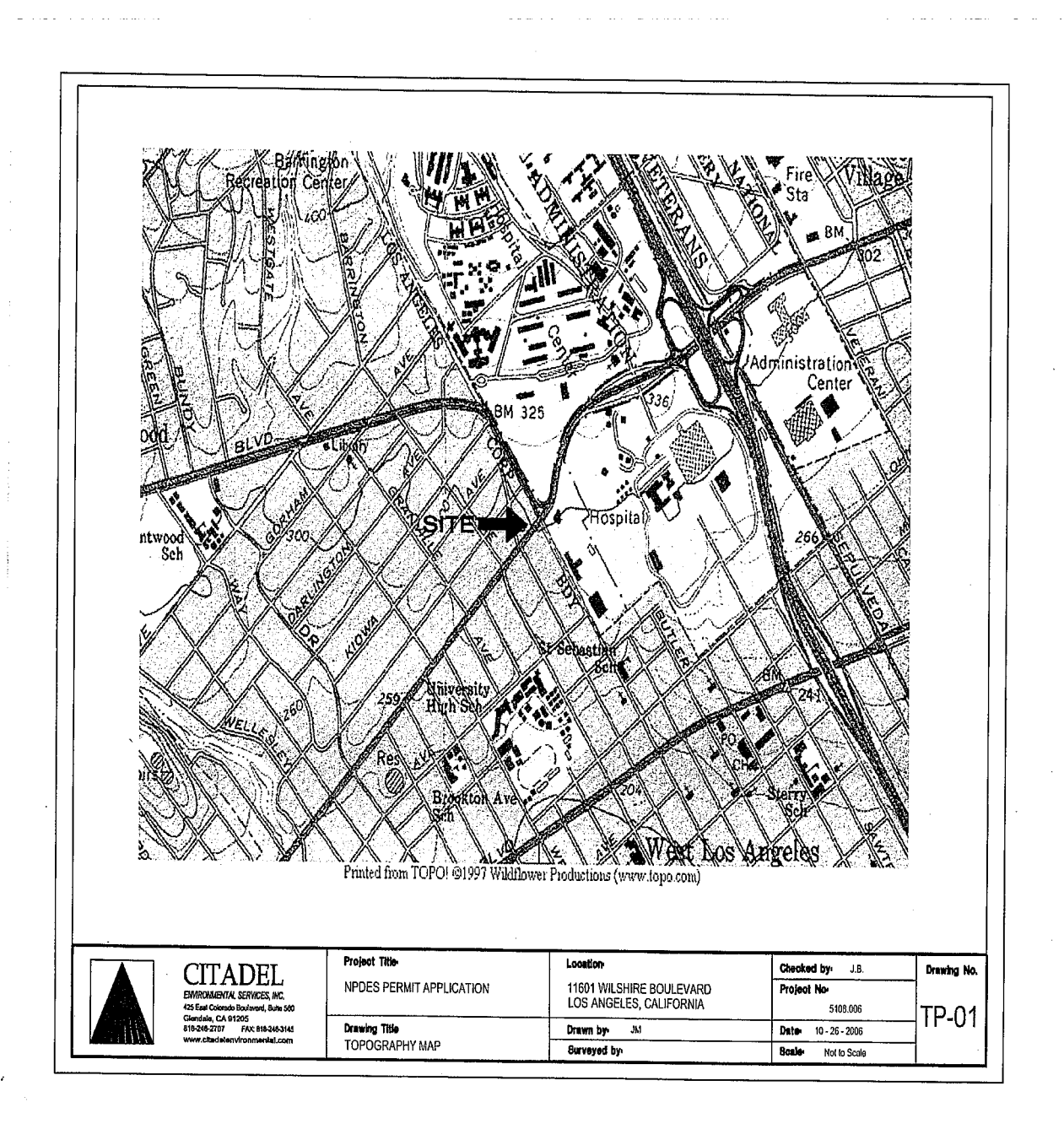
Site Location Figure 1