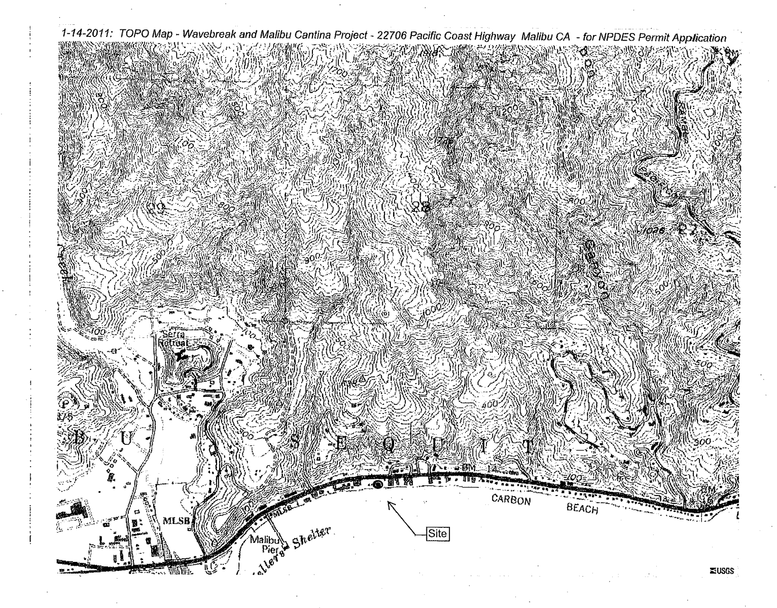
Figure 1-Site Location