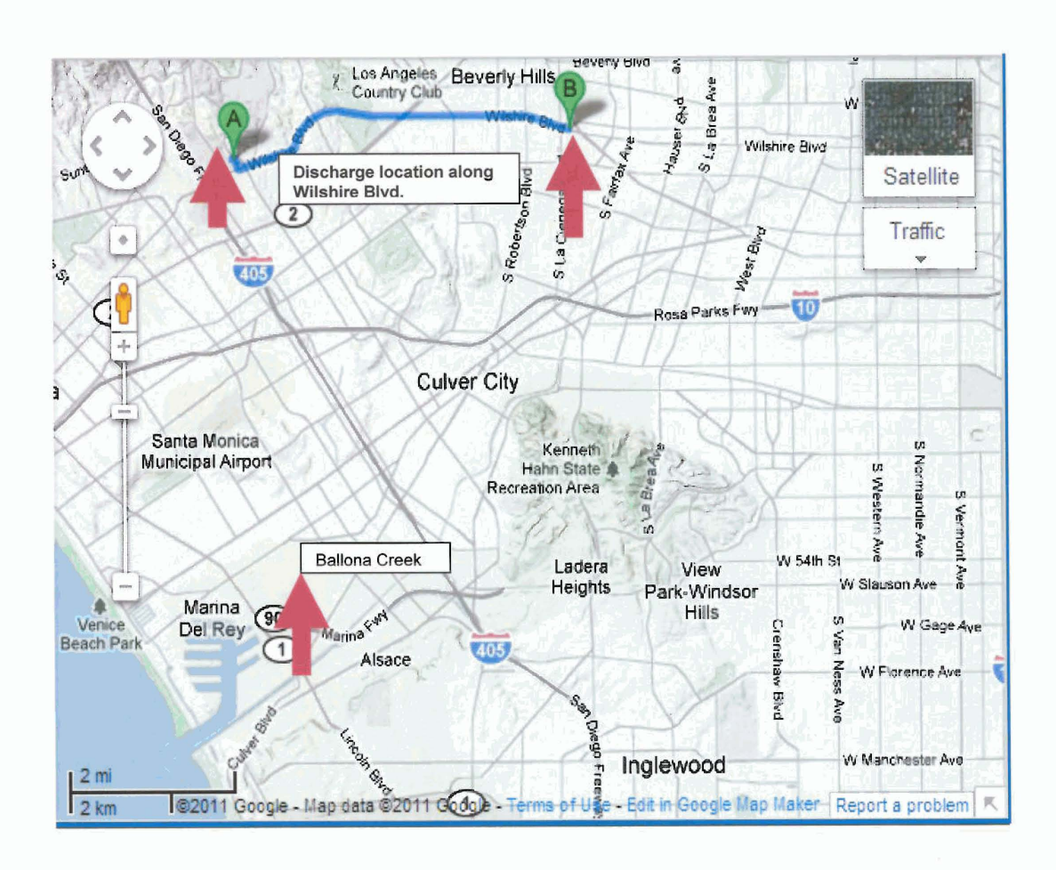
Figure 1. Site Location Map