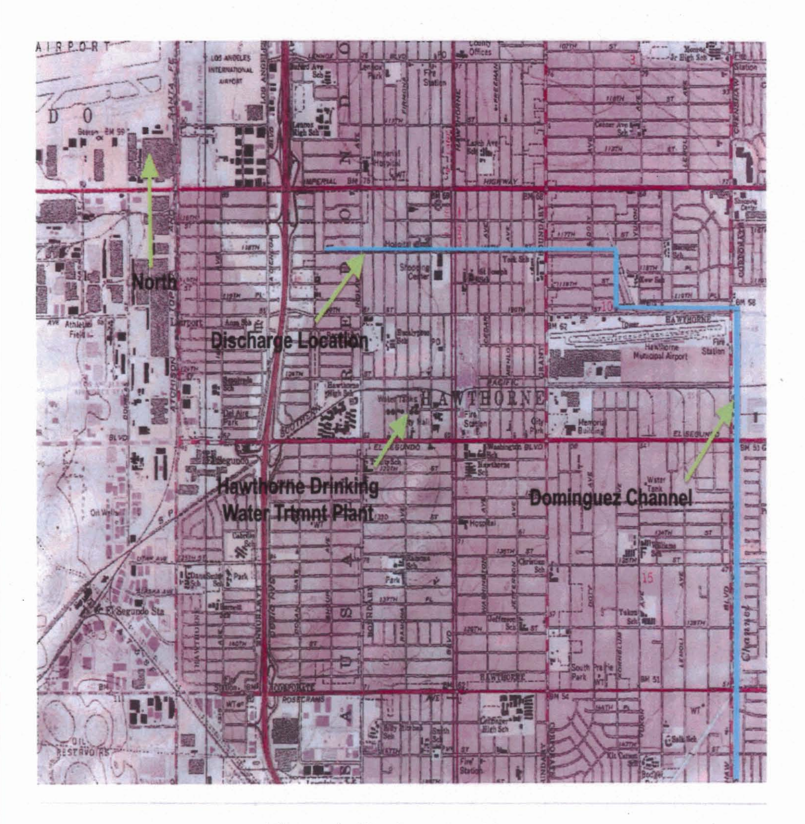
Figure 1. Site Location Map