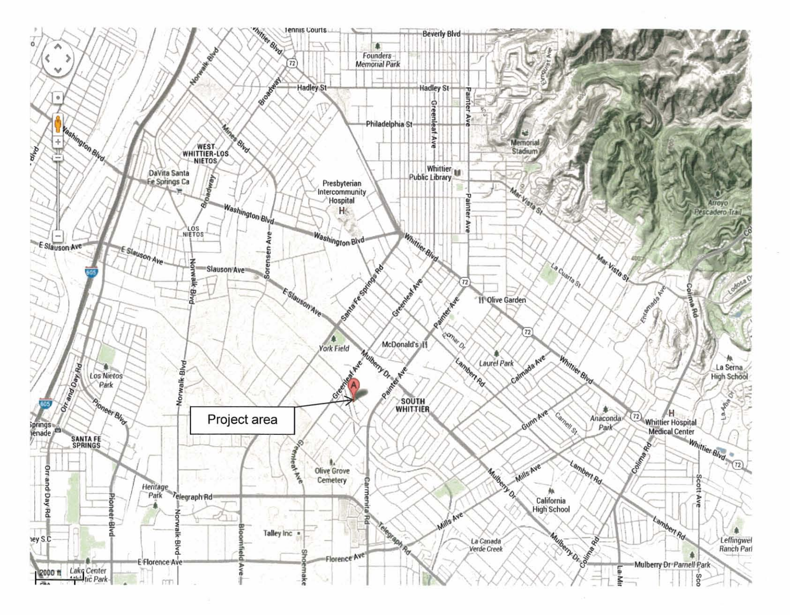
Figure 1. Site location map

Suburban Water Systems CAG6740041 Fact Sheet CI-9968