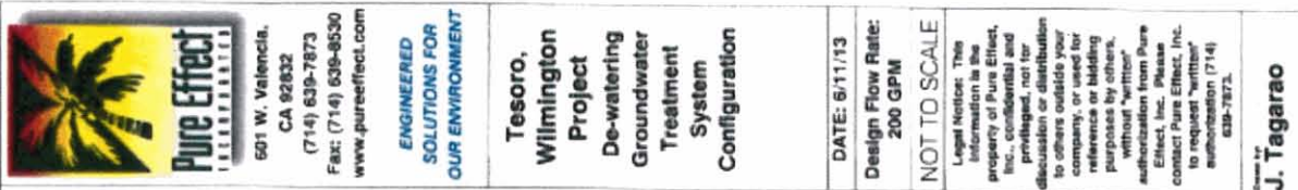
Figure 1. Schematic of the treatment system