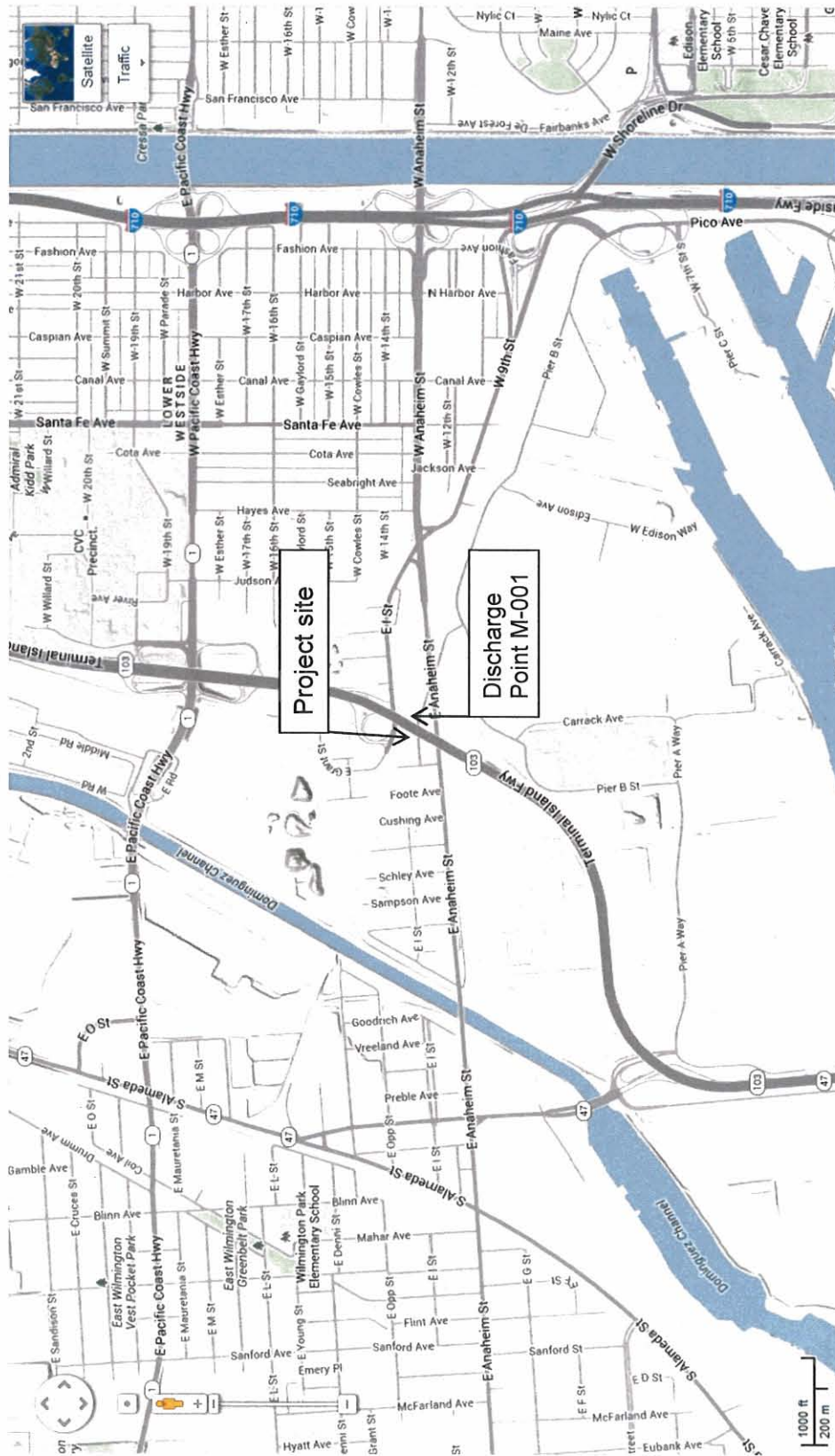
Figure 2. Site location map