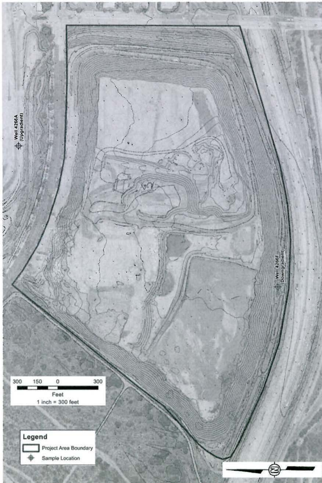
Site Map with Well Locations Figure 2