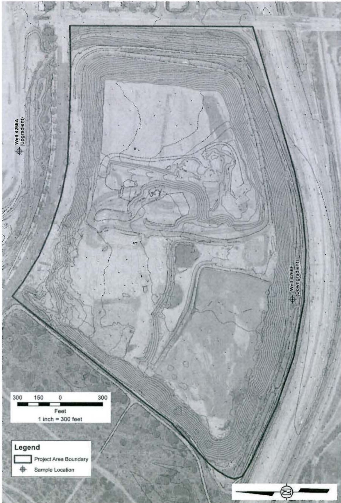
Figure T - 1. Groundwater Monitoring Well Locations