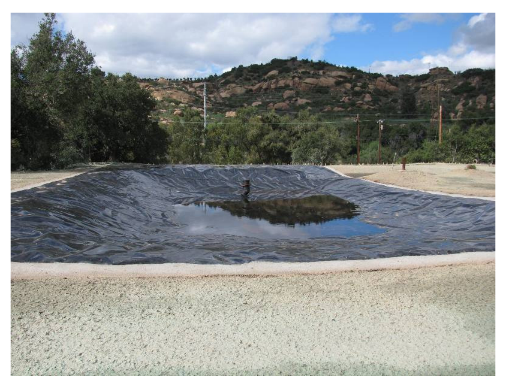
The basin operated well during recent rain events. The water collected and the perforations in the liner allowed the slow percolation of the runoff into the soil. This basin is located on top of a slope that creates the start of the Outfall 009 drainage. It is directly adjacent the guard entry gate.