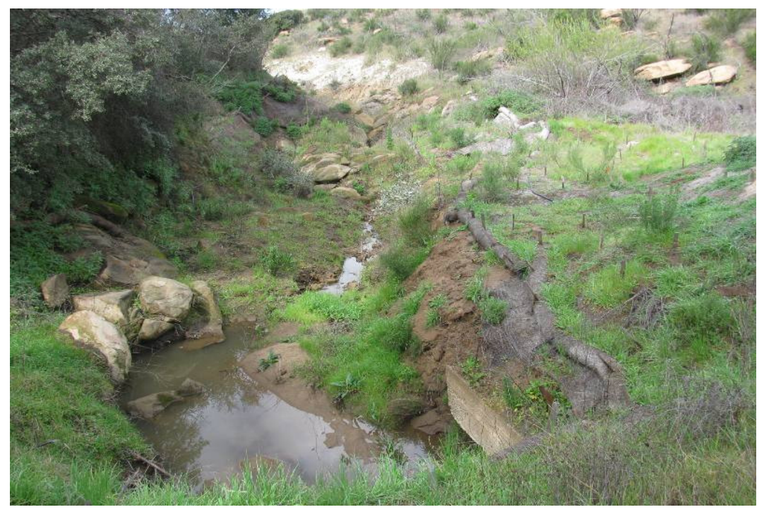
The area in the photo above is about 300 feet upstream of the LOX area. The slopes have decayed. Sediment is evident in the streambed.