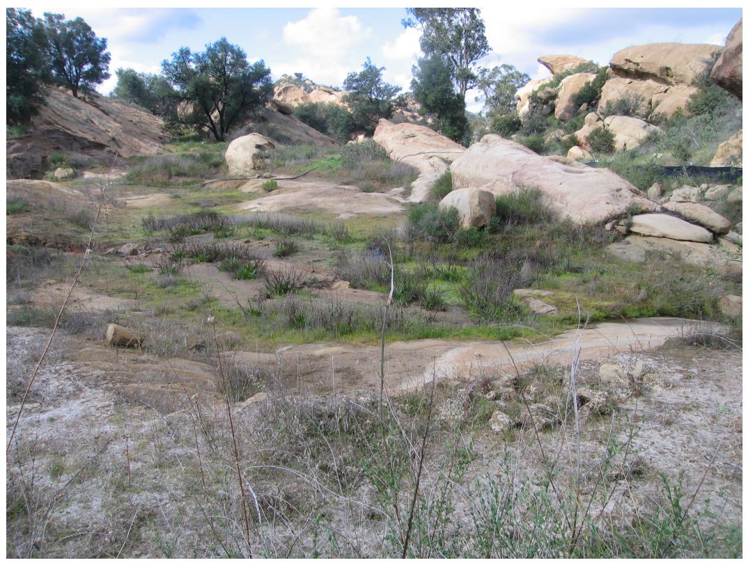
Much of the area in the photo above was excavated to bedrock. Whenever there is a small amount of soil available, new grass and native plants are evident. In some areas where the plants have not grown in naturally, the Discharger as per the Expert Panel direction has installed some plants.