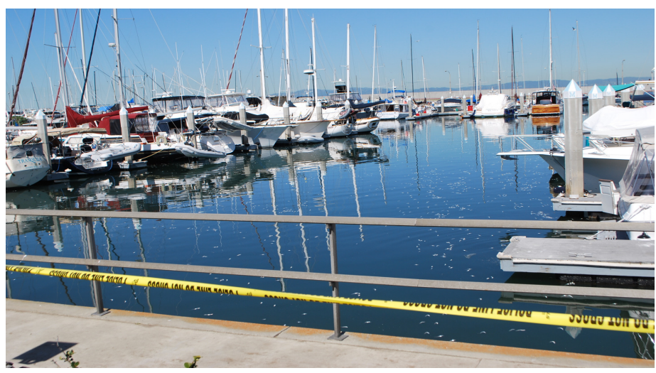
March 9, 2011. Remaining fish floating on the surface. Most of the dead fish not removed the previous day were now on the bottom of the marina.