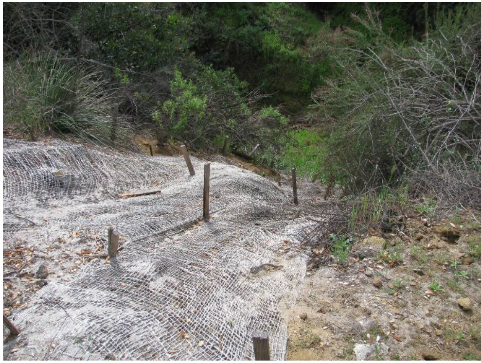
This is directly adjacent the LOX area. The lack of vegetation causes the hillside to be unstable. This is another area identified for additional stabilization including BMPs.

This is an area where additional BMPs are required. The recommendation regarding the specific BMP and the size of the BMP will be developed with input from the Expert Panel. Regional Board and DTSC staff will review the proposal prior to the implementation of the final BMPs.