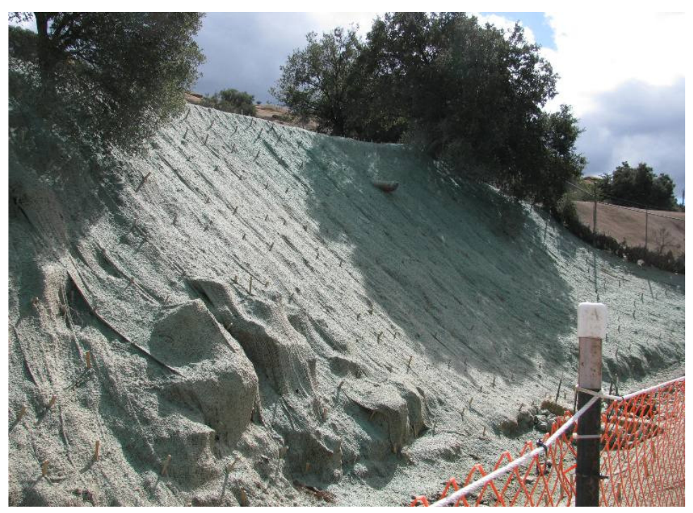
This slope ends at the drainage that carries flow underneath the road and continues through the Outfall 009 watershed. After each rain event the BMPs are inspected and replaced, if required.