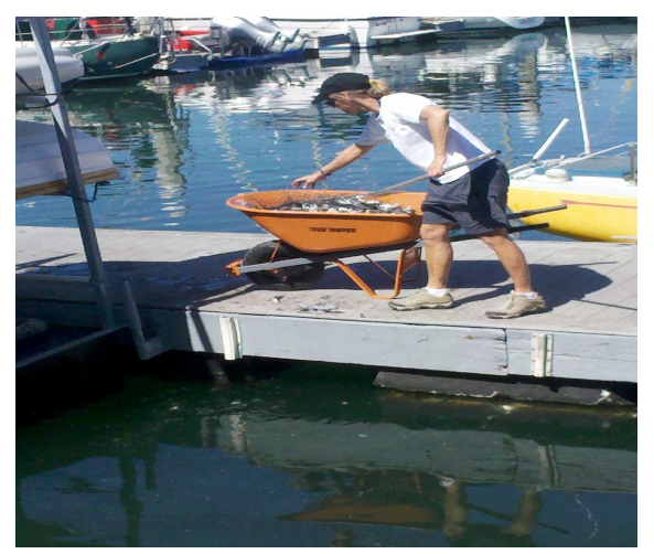
March 9, 2011. Volunteer assisting with the fish clean-up using hand nets.