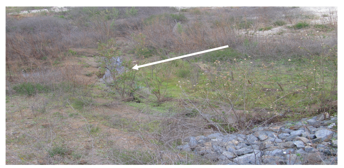
This are is located directly north of the lower parking lot used for staging soil after excavation. This entire area was denuded during the excavation. Three years after the beginning of excavation activities natural plant life is vibrant. Note the rip rap that was installed during the excavation activities and the stream flow that is marked by the arrow.

Many of the areas have a considerable amount of vegetation growing.