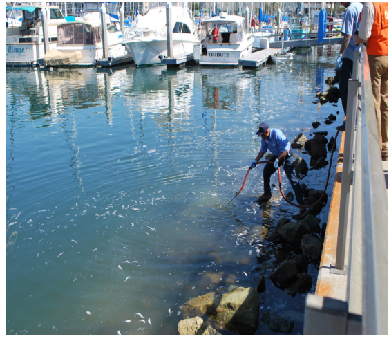
March 9, 2011. City staff piloting methodologies to remove fish from the bottom of the marina.