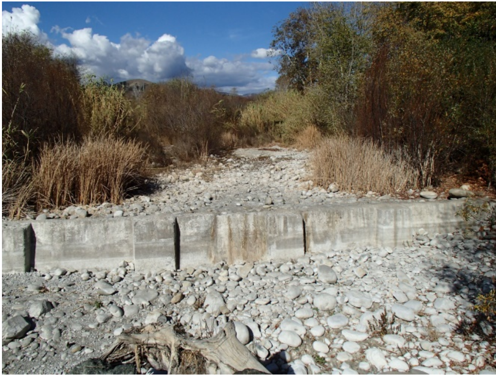
Figure 2. Dry Ventura River at the Foster Park subsurface dam and diversion on November 22, 2013. Dry conditions at Foster Park were prevalent throughout the 2013 - 2014 dry seasons.

For example, as seen in Figure 2 and as documented at the USGS gage, the River was completely dry at Foster Park throughout much of the 2013-2014 dry seasons.