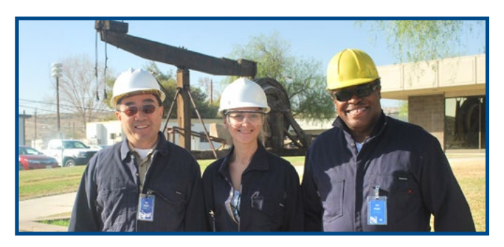
Caption: Los Angeles Water Board Staff/Inspectors

With over 10 million residents, the Los Angeles Water Board regulates the most densely populated region in the state, including the coastal watersheds of Los Angeles and Ventura Counties and small portions of Kern and Santa Barbara Counties.