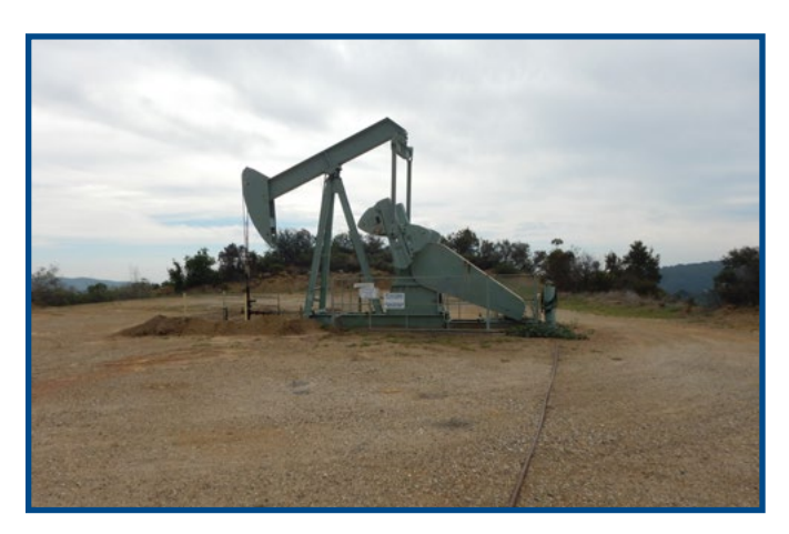
Caption: Oil Pump