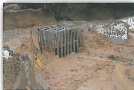
Figure 1. Overwhelmed storm drain inlet at PVDS/25th St.

San Ramon Canyon is a natural, typically dry canyon streambed in the City of Rancho Palos Verdes that sits directly north of and above Palos Verdes Drive South (PVDS)/25th Street in the City of Los Angeles. It is surrounded by residential homes to the north, Friendship Park to the east, Palos Verdes Drive East (PVDE) switchbacks to the west, and PVDS/25th Street and 242 mobile homes to the south. Accelerated erosion of the canyon and localized slope movement are contributing to heavy sediment loads, and causing excessive amounts of mud and debris to be washed down the canyon. During moderate to severe rain events, the canyon conveys sediment laden storm water runoff generated from the upstream tributary watershed approximately 3,300 feet downstream. It is then directed to a storm drain inlet system at PVDS/25th Street, which discharges to the Pacific Ocean. Floodwater, mud and debris regularly overwhelm the inlet during a storm event (see picture below).