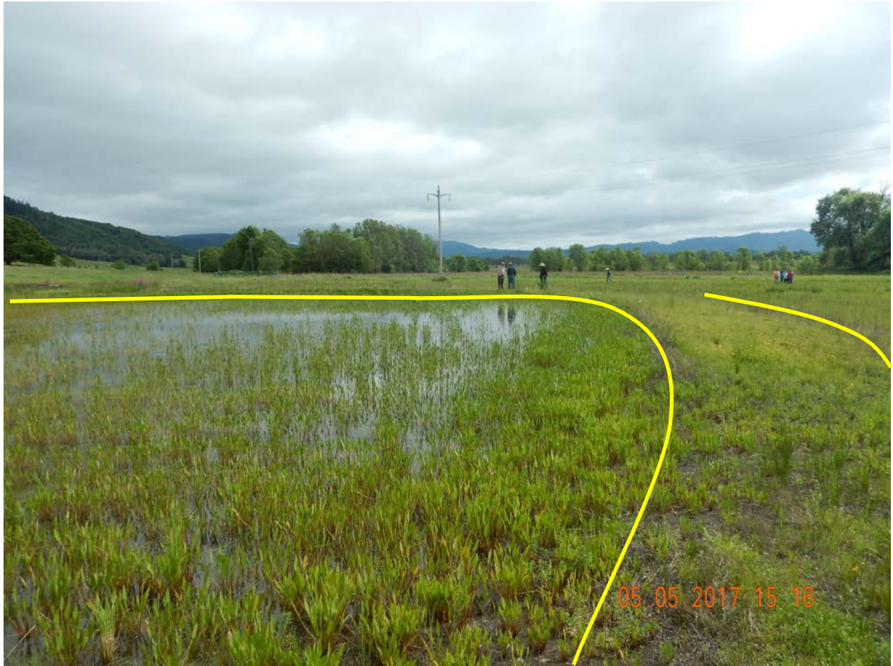
Photo taken on 5/5 - Standing on berm facing south. Ponding seen within berm limits, highlighted in yellow.