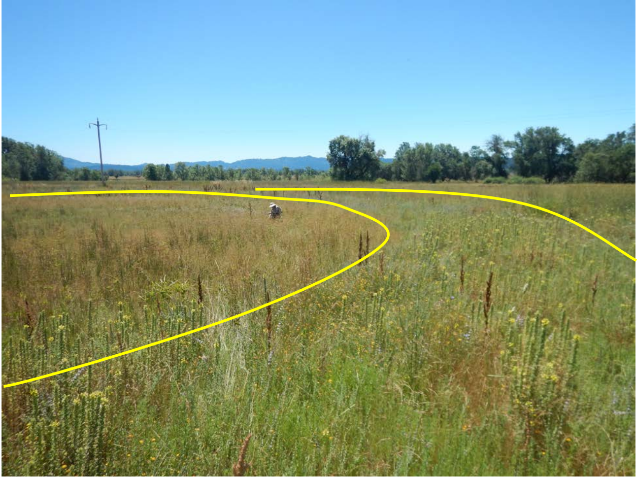
Photo taken on 6/29 - Standing on berm facing south/southwest. Berm highlighted in yellow. Ponding not present in this photo.