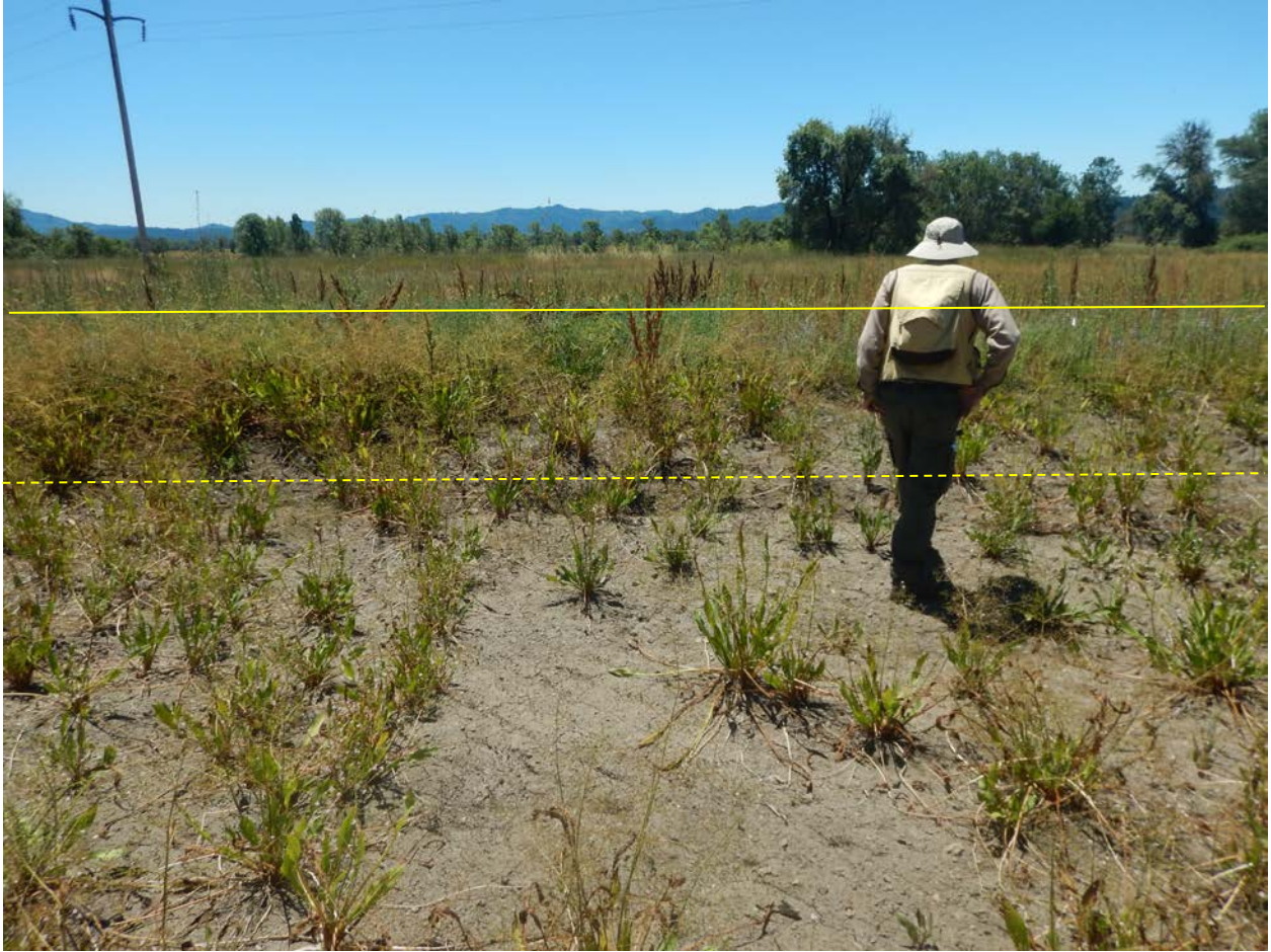
Photo taken on 6/29 - Standing in previously inundated pond facing southwest. Lower limit of berm highlighted in a dotted line, top of berm highlighted with a solid line.