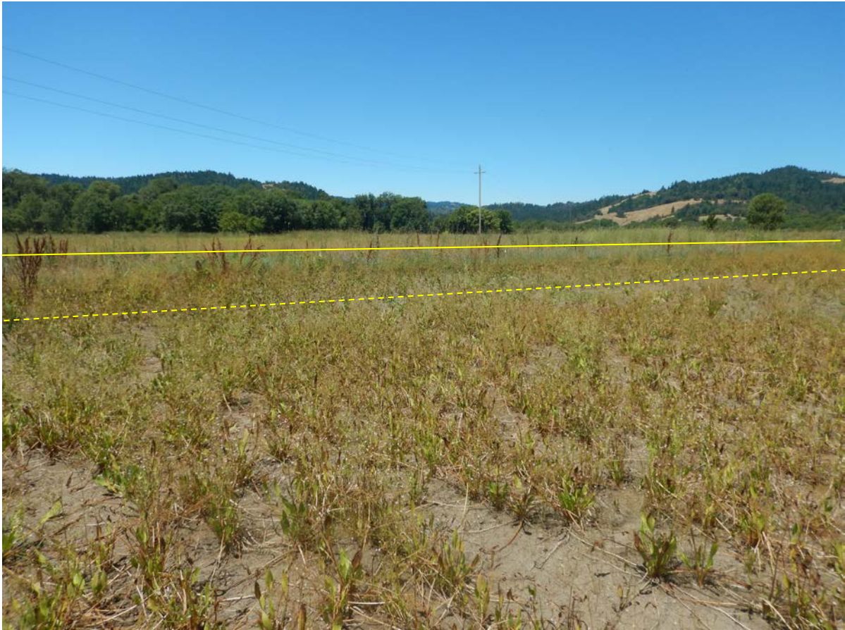
Photo taken on 6/29 - Standing in previously inundated pond facing west. Lower limit of berm highlighted in a dotted yellow line, top of berm highlighted with a solid yellow line.