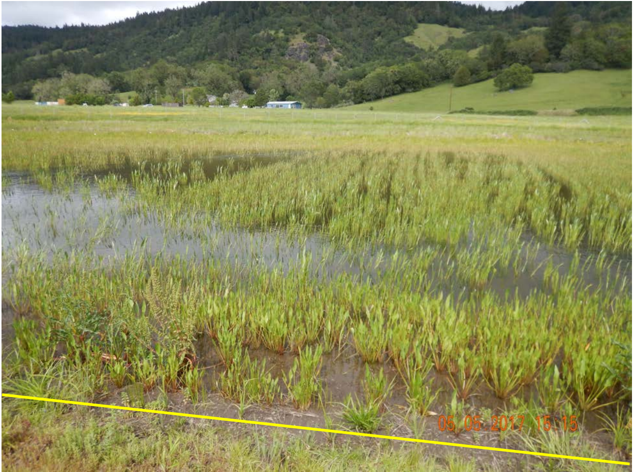
Photo taken on 5/5 - Standing on berm facing northeast. Lower edge of the berm highlighted in yellow.