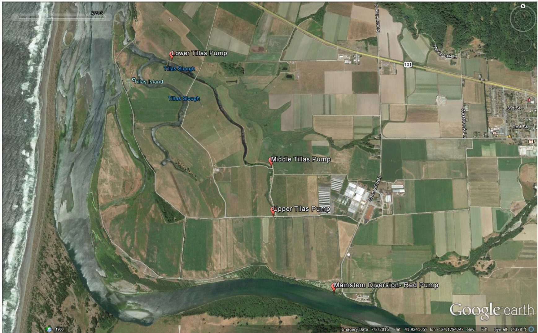
Figure 2: Reservation Ranch Pump Map.