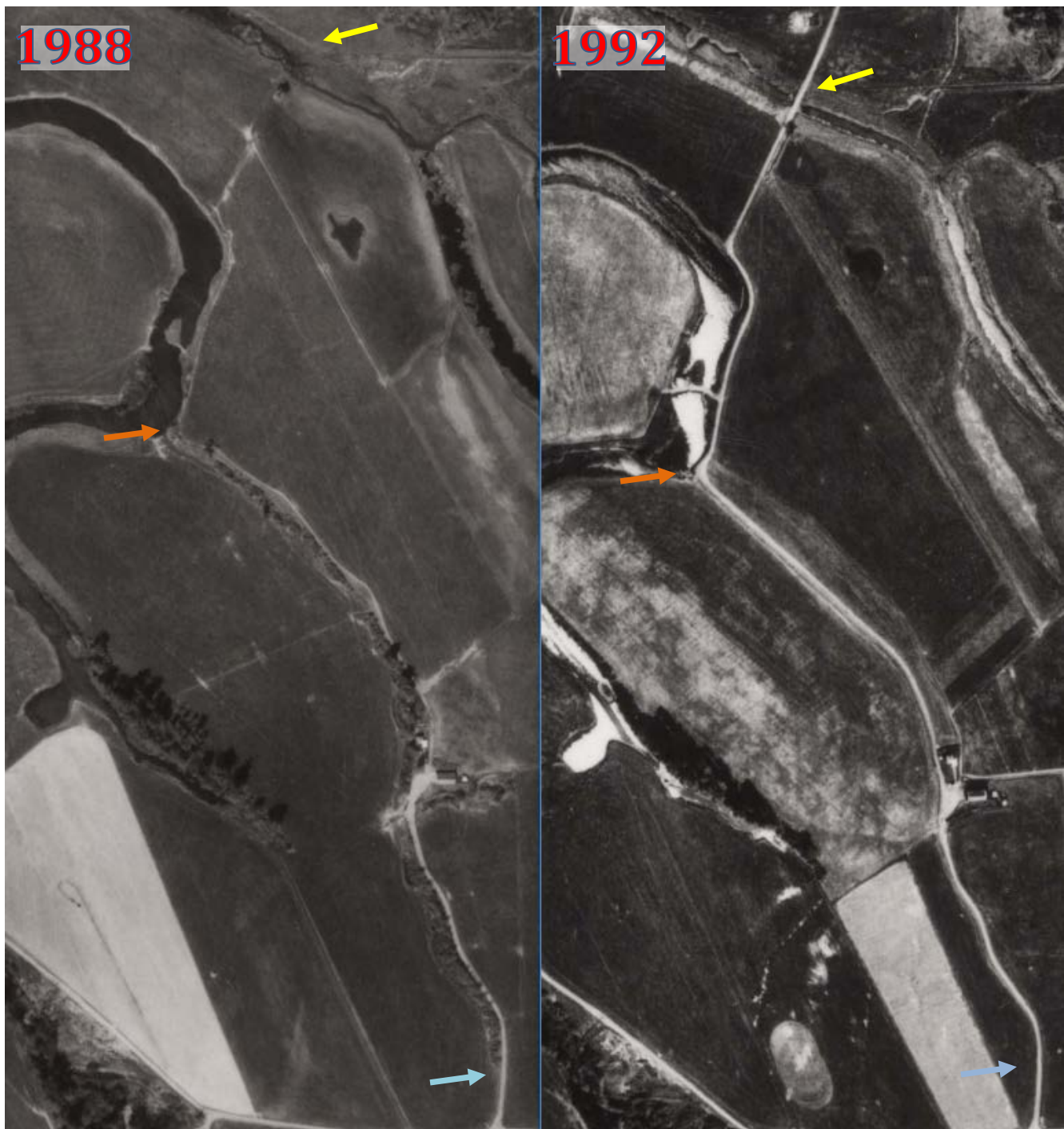
Figure 3: Construction of a new road, including a crossing over the east fork of Tillas Slough, reconstruction of an existing road, removal of riparian vegetation, and straightening of unnamed state waters appears to have occurred in the area between the yellow and blue arrows, between 1988 and 1992. Removal of riparian vegetation and straightening of unnamed state waters occurred in the area that lies between the orange and blue arrows.

1988 Image capture date: March 30, 1988.