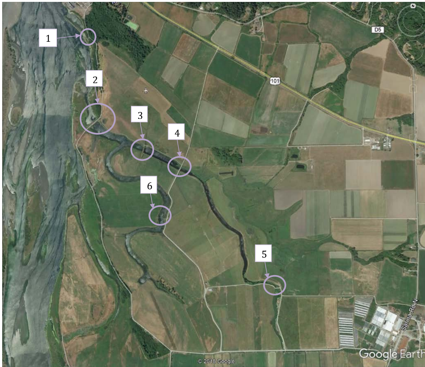
Figure 1: Reservation Ranch crossings. Imagery Date 7/2/2016.