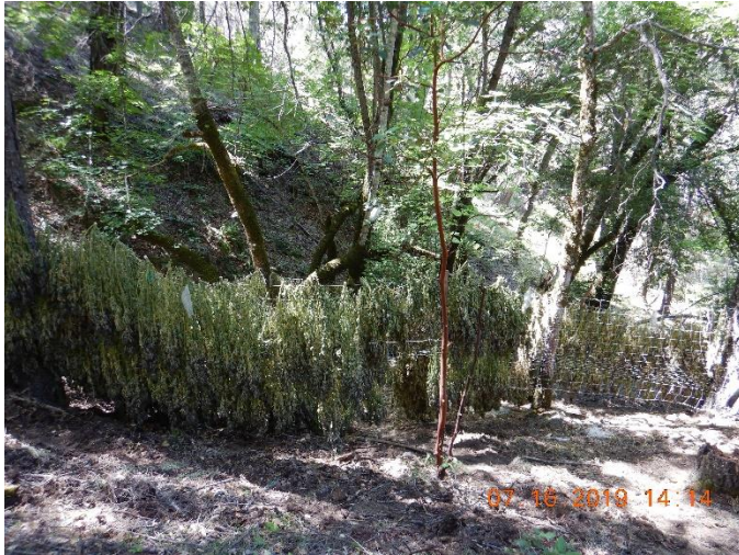
Photo 3 – Cannabis being dried in watercourse (“Cannabis in Class 2” on Figure 1)