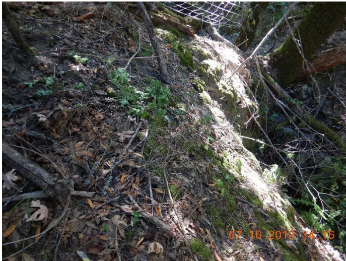
Photo 5.1 – Damage to riparian corridor from cannabis drying area installation