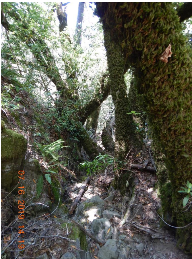
Photo 5 – Cannabis being dried in watercourse (“Cannabis in Class 2” on Figure 1)