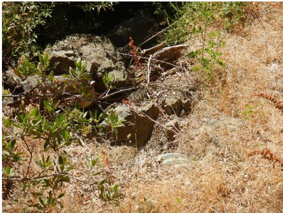
Photo – 7 Outlet of undersized culvert at inspection points 3, 4, and 5.