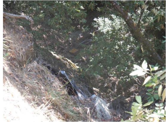
Photo – 18 View of stream channel with trash and debris.