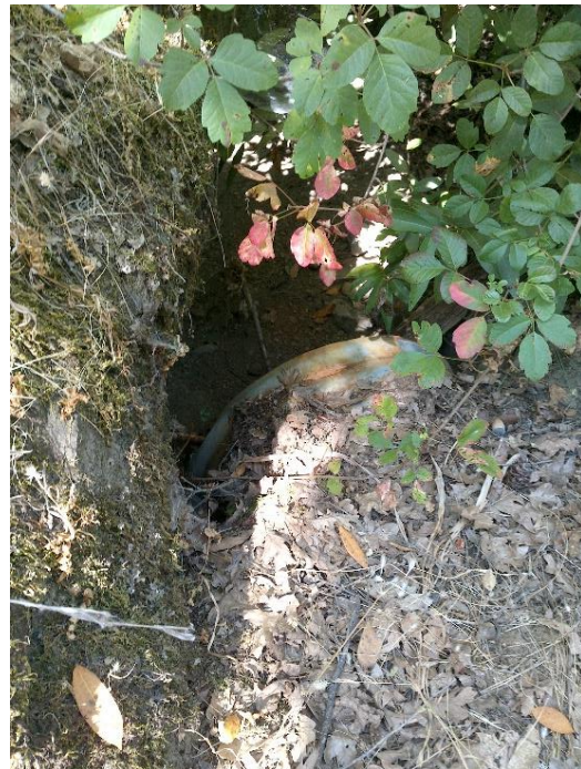
Photo – 16 An undersized culvert with sediment discharge.