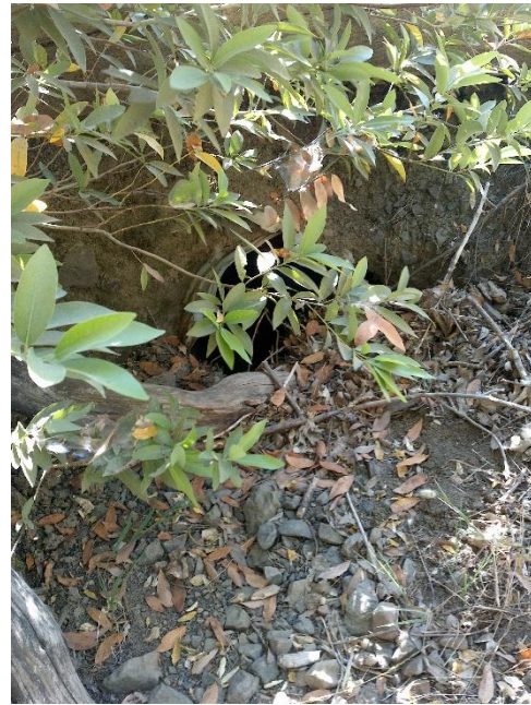
Photo – 6 Undersized culvert inlet filled with sediment and debris in watercourse. (Inspection points 3,4,5)