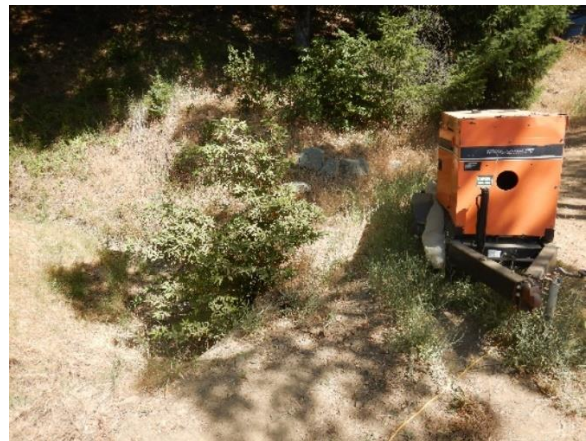
Photo – 2 Diesel generator on a class III watercourse (inspection points 3 & 4).