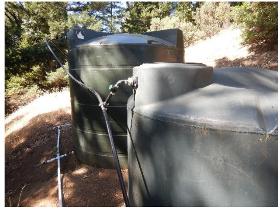
Photo – 14 Primary water tank storage area.