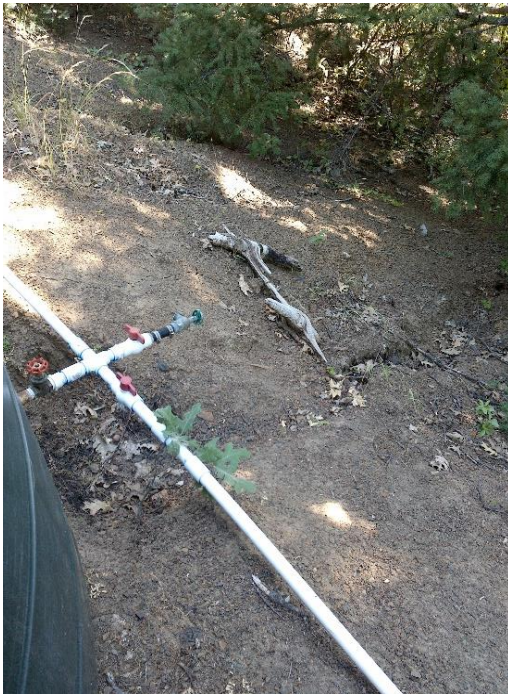
Photo – 15 Rill erosion caused by discharge from water storage tanks.