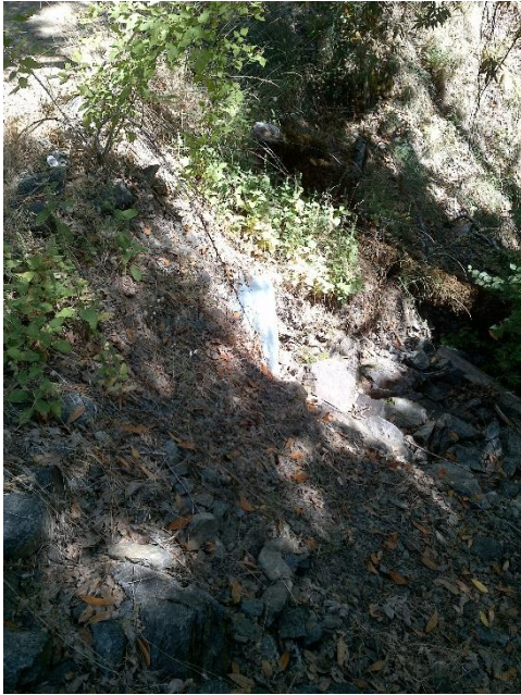
Photo – 17 Culvert outlet.