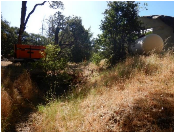
Photo 5 – Diesel generator above the culvert inlet at inspection point Cannabis cultivation area #2 and fuel tank are visible in this image and are less than 50 feet from the Class III watercourse at this location. (Inspection points 3, 4, and 5)