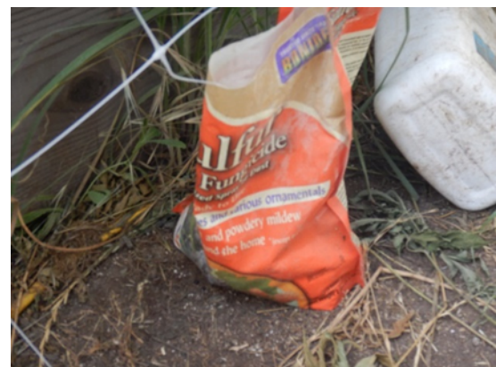
Photo – 8 Pesticide, fertilizer, and sediment, debris, and trash are visible in the netting.