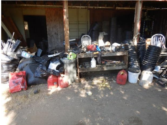
Photo – 9 Storage area with petroleum products, chemicals, cultivation materials.