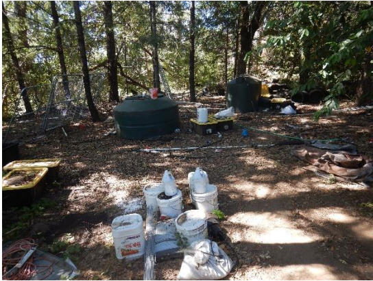
Photo – 13 Secondary tank area with fertilizers and other chemicals on the ground.