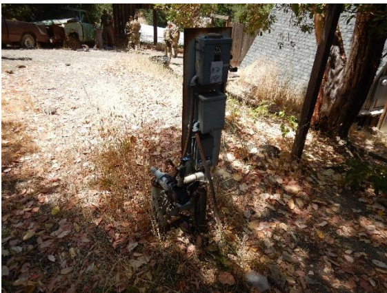
Photo 3 - Ground water well and pump.