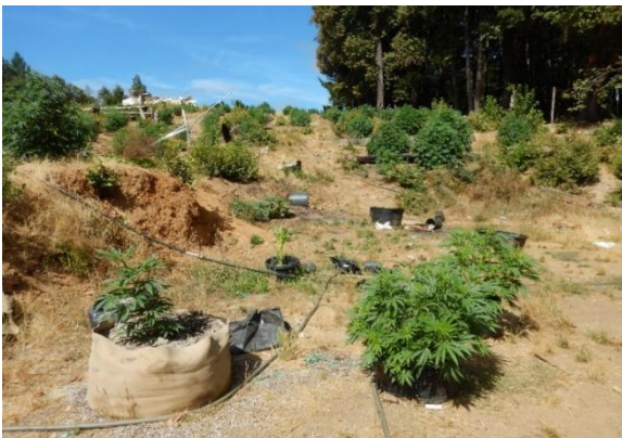
Photo 1 – MP1; outdoor cannabis cultivation on a sparsely vegetated slope