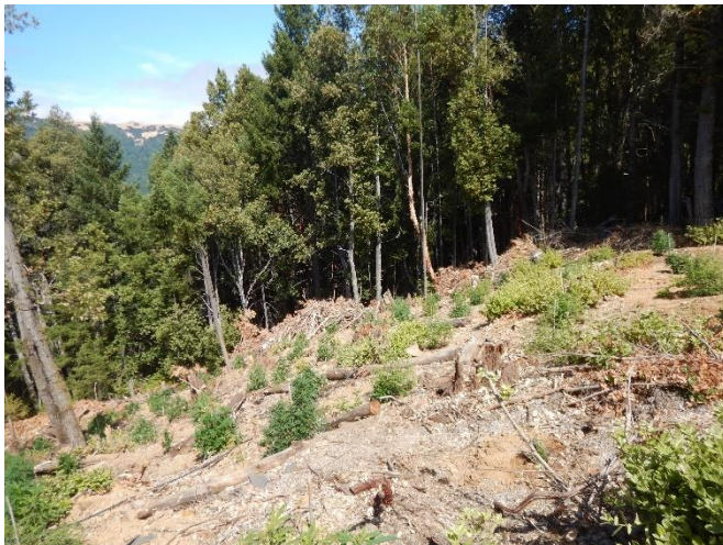
Photo 5 – MP6; perlite visible in foreground abandoned or spread on steep slope