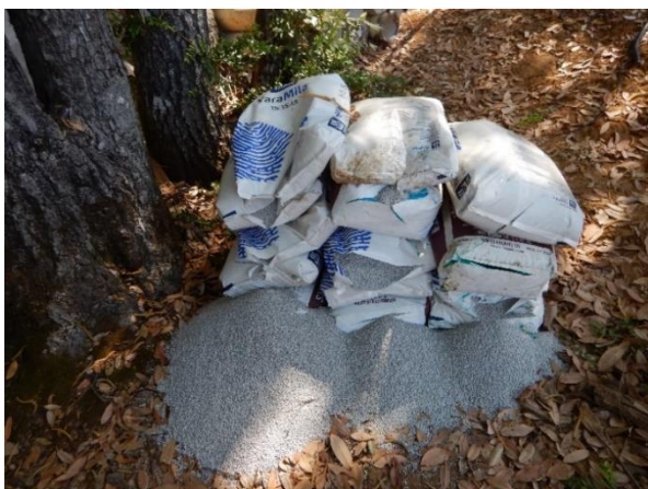
Photo 6 – MP7; twelve open bags of fertilizer spilt on bare ground