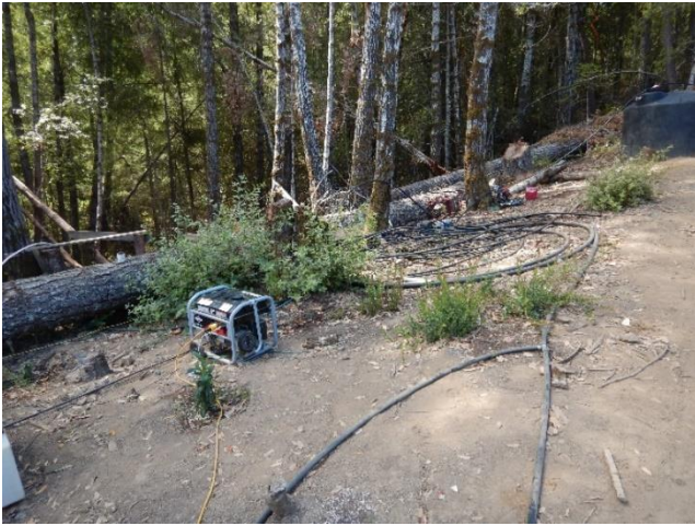
Photo 2 – MP2&3; generators and fuels stored outside without secondary containment