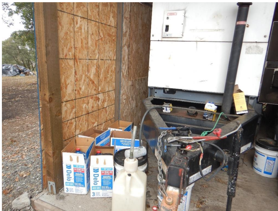
Photo 14—Generators and oil stored covered with impermeable floor in the vicinity of WQ 7.