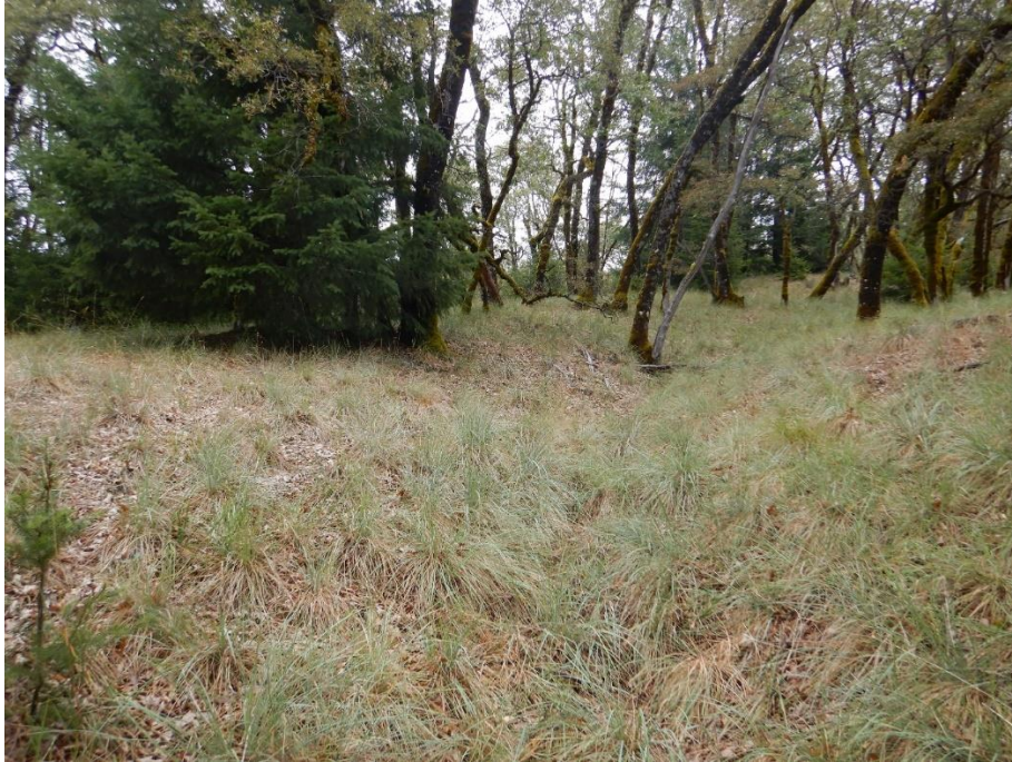
Photo 11— Looking upstream at watercourse located 100 feet north of WQ 6.