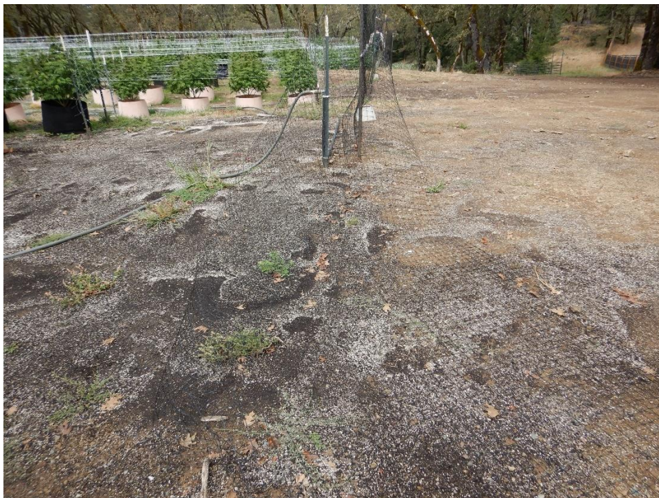
Photo 1—Outdoor cannabis cultivation southwest of WQ 1. Note white speckles of perlite showing that potting soils have spread away from cultivation area.