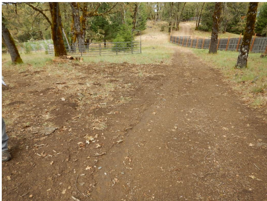
Photo 2— Looking north along road in the vicinity of WQ 1, note rill or rut on the left side of the road.