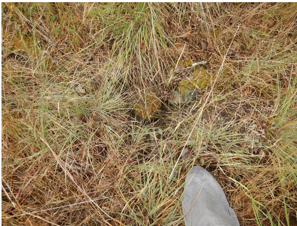
Photo 7—Picture of ground at WQ 4. Note voids surrounding larger cobbles suggesting fine sediment had been transported by surface flow.