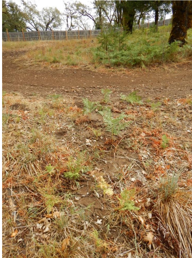
Photo 3—Looking east at road in the vicinity of WQ 2. Road discharges to cannabis cultivation area to the northwest.