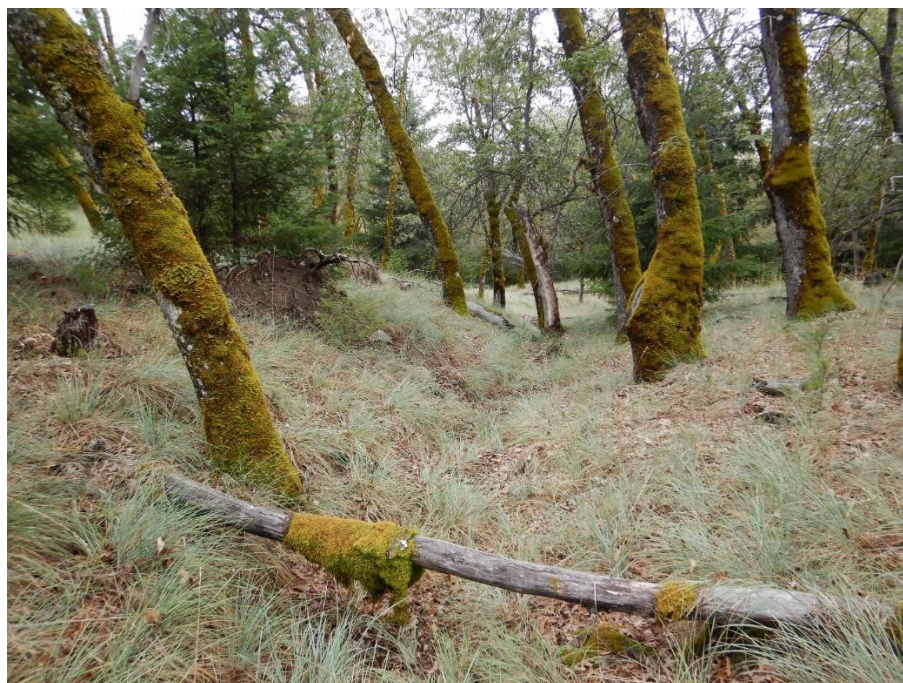
Photo 10—Looking downstream at watercourse located approximately 100 feet north of WQ 6.