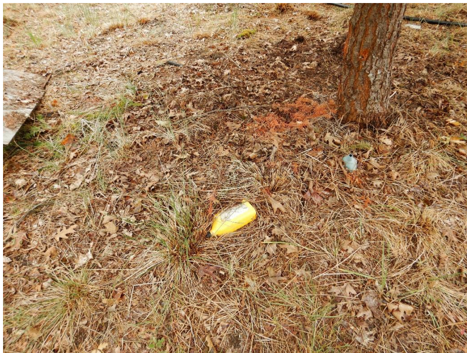
Photo 9—bottles of waste motor oil on the bare ground at WQ 6. Note there is no cap of the bottle closest to the tree in the upper right of the image.