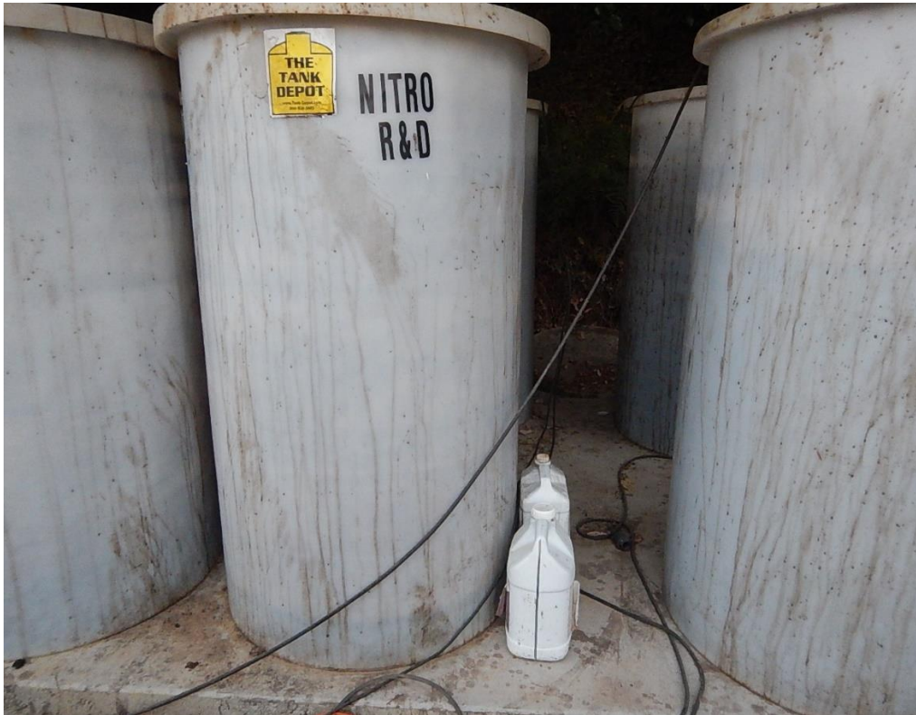
Photo 7, Fertilizers at inspection point Fert