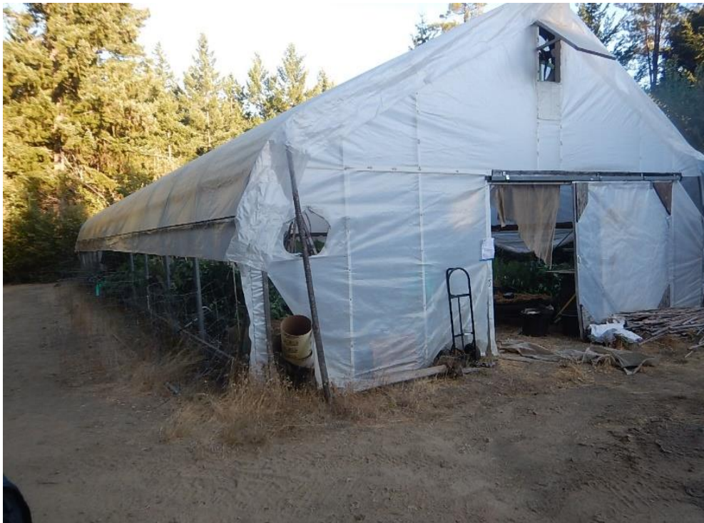
Photo 4, Green house at inspection point GH1