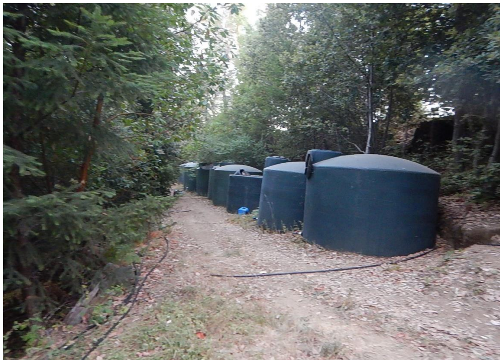
Photo 6, Water storages at inspection point WST2