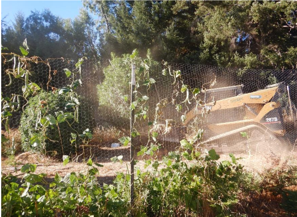
Photo 3, Open grow at inspection point OG1