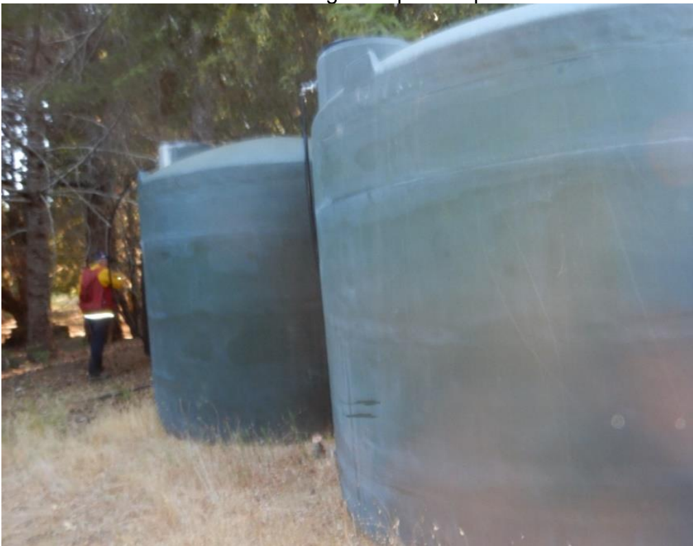
Photo 2 water storage tanks at inspection point WST1