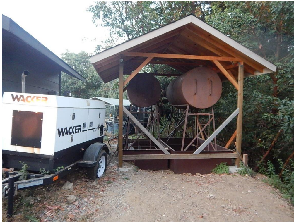
Photo 5, Petroleum and generator at inspection point Fuel