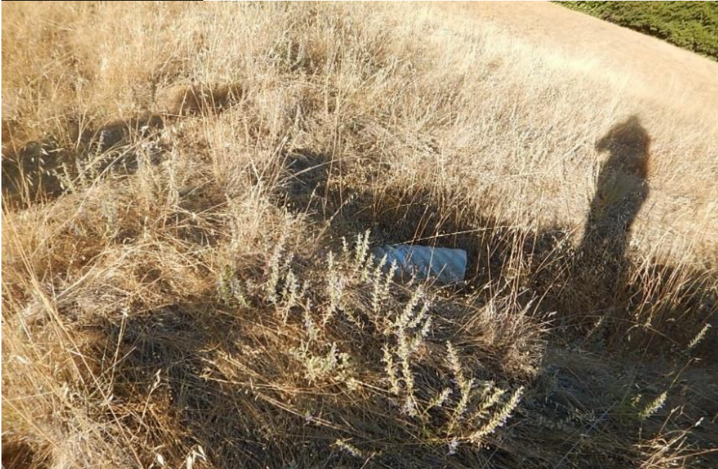
Photo 1 Culverted stream crossing at inspection point CMP