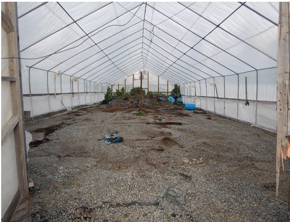
Photo 8, Green house at inspection point GH2