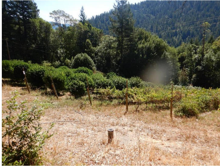
Photo 1—Approximately 12,000 square feet of cannabis growing outdoors in the vicinity of WQ 1. Plants in the left of the image are cannabis.