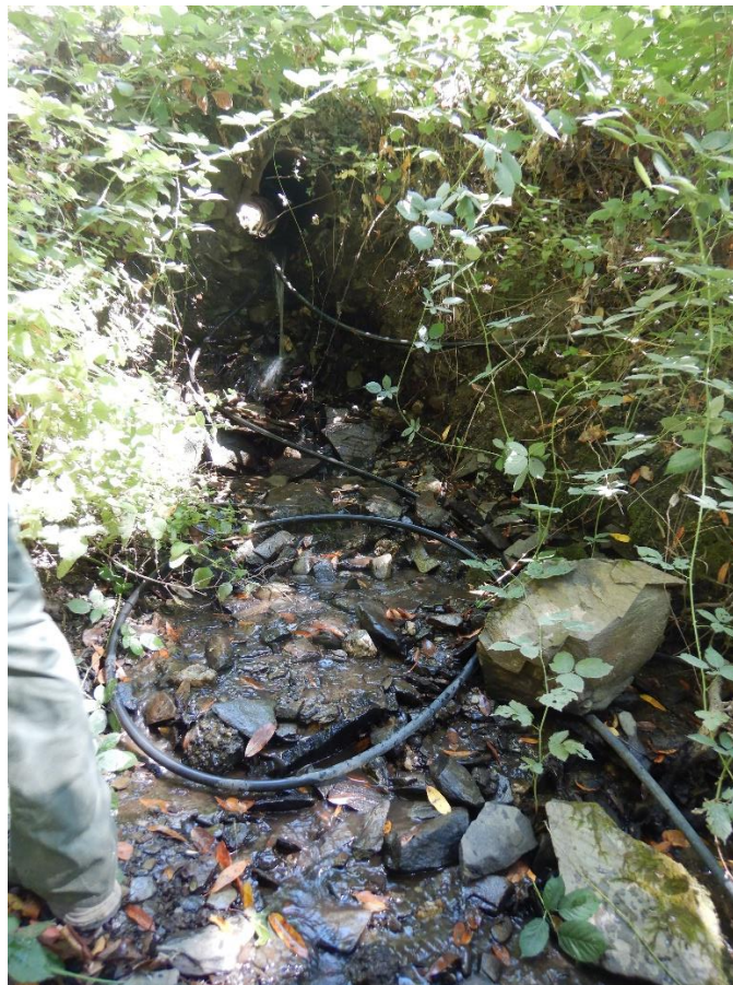
Photo 2—Approximate 5-foot wide watercourse with 18 to 24-inch diameter culvert that has rusted through the bottom below the road upstream.