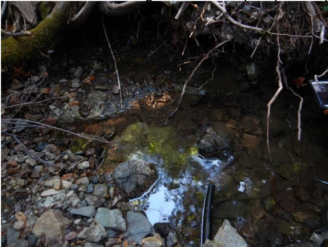
Photo 17, Point of Diversion at inspection point POD1