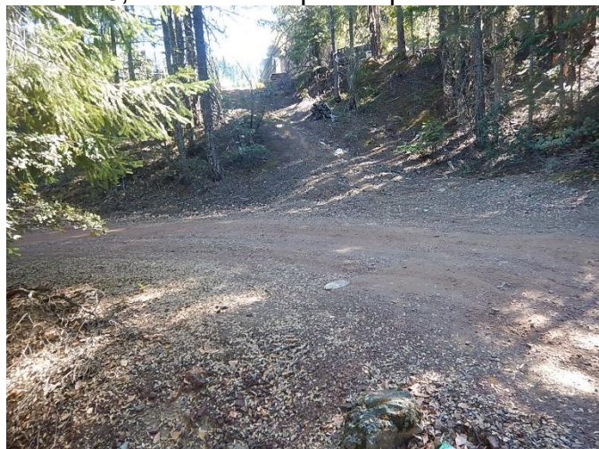
Photo 19, Threatened sediment delivery from the road near SC2