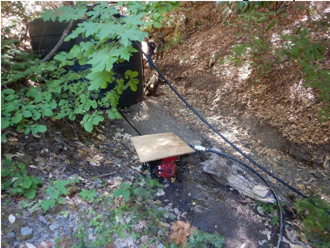
Photo 16 water storage tank and a pump at inspection point Surface flow