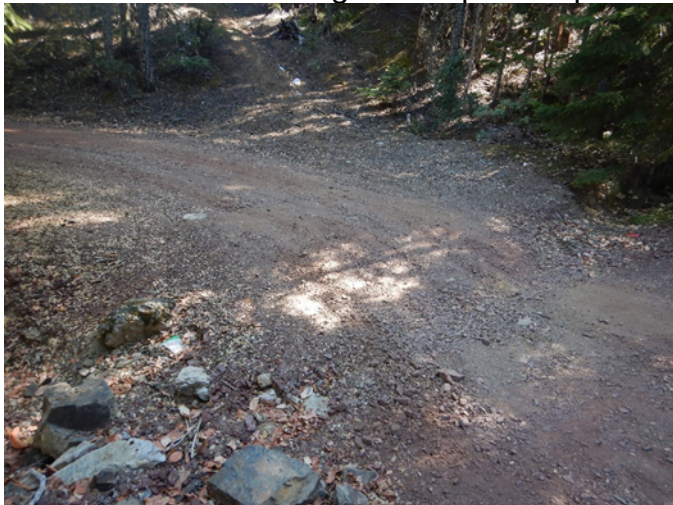
Photo 2 stream crossing 2 at inspection point SC2