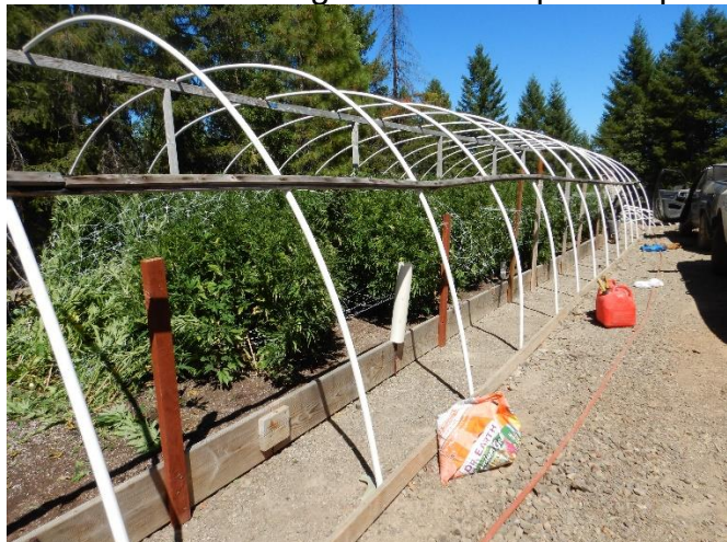
Photo 4 Cannabis cultivation area at inspection point GH1