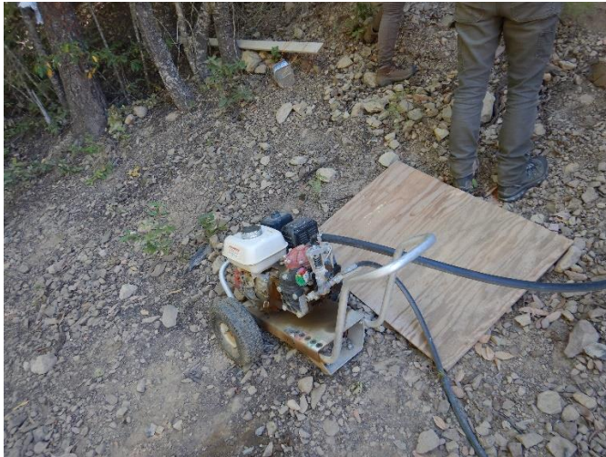
Photo 12, Uncontained pump near inspection point WSTG2