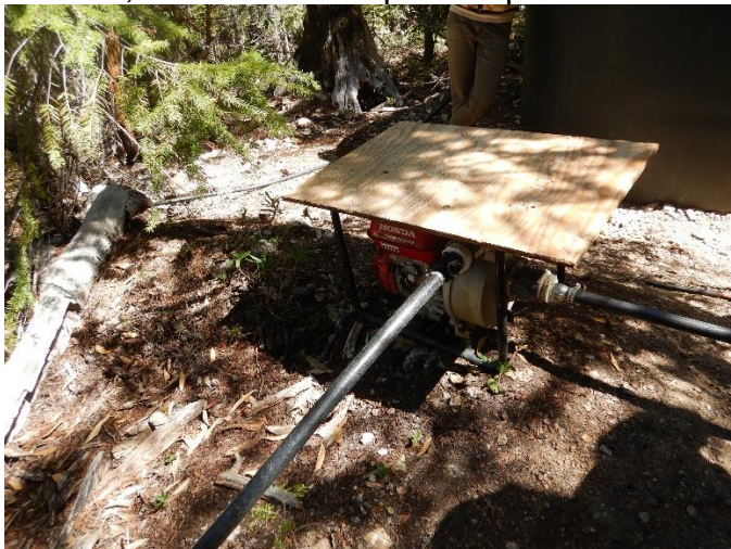
Photo 8 uncontained pump at inspection point Tank pump