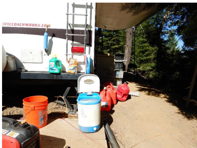
Photo 18, uncontained plastic petroleum containers near inspection point GH1