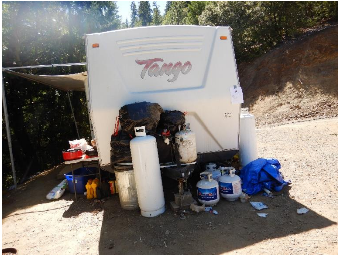
Photo 6 Uncontained propane containers near GH1