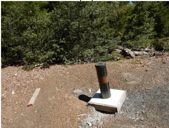
Photo 7, well head at inspection point Well