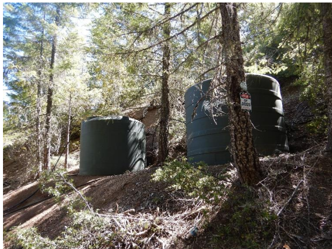
Photo 3 water storage tanks at inspection point WSTG1