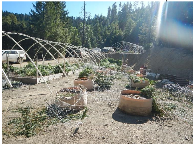
Photo 5 Cannabis cultivation area at inspection point GH2