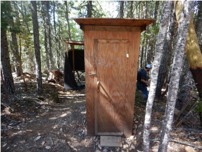
Photo 11 outhouse toilet near inspection point GH3