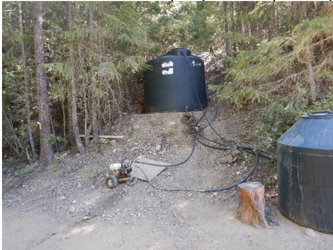
Photo 13, Water storage tanks and irrigation pump at inspection point WST2