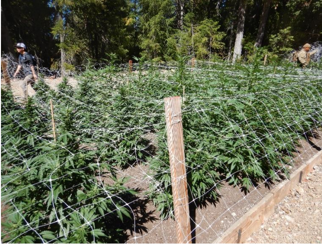
Photo 10 cannabis cultivation at inspection point GH3