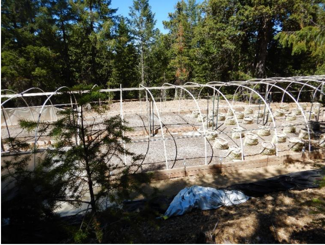
Photo 9 unused former cultivation site at inspection point OG1