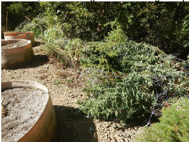
Photo 14, Cultivation waste at inspection point Cultwst