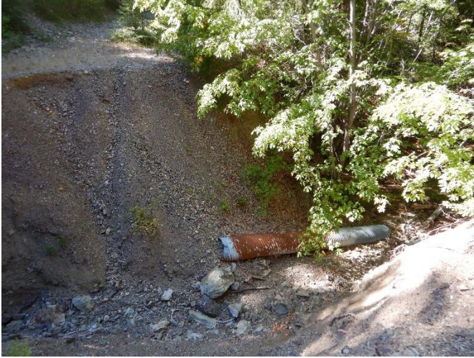
Photo 15 blown out stream crossing at inspection point SC3