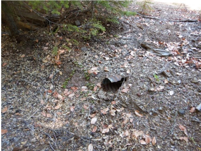
Photo 1 stream crossing 1 at inspection point SC1